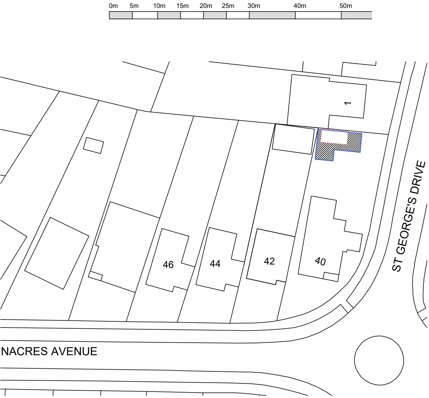
Block Plan 1 : 5 0 0