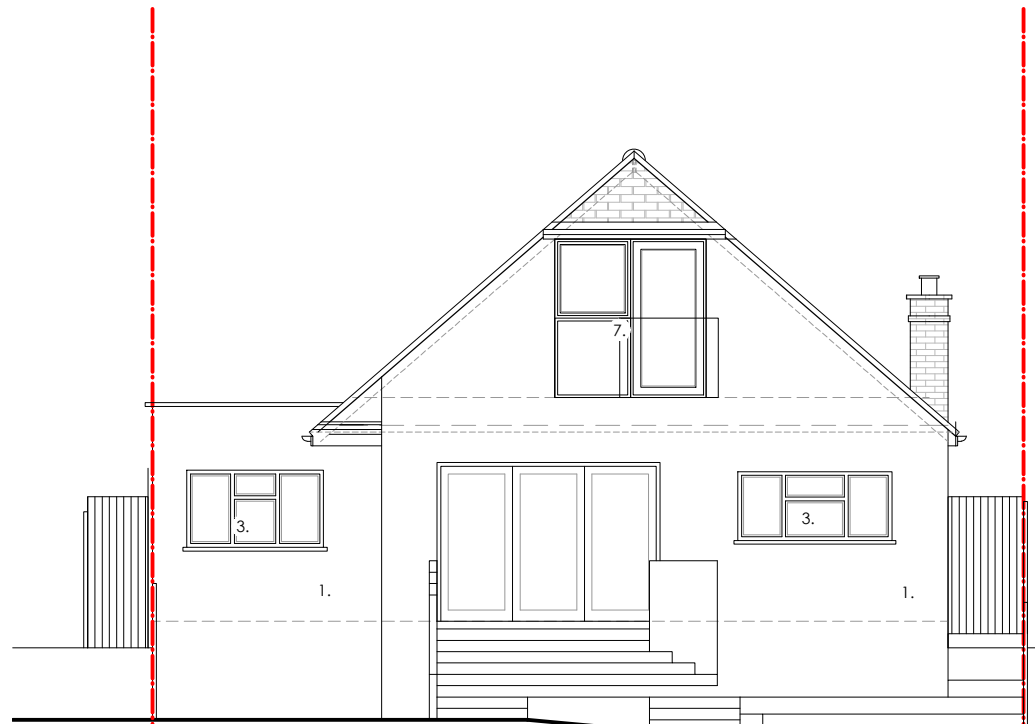
04 PROPOSED REAR ELEVATION