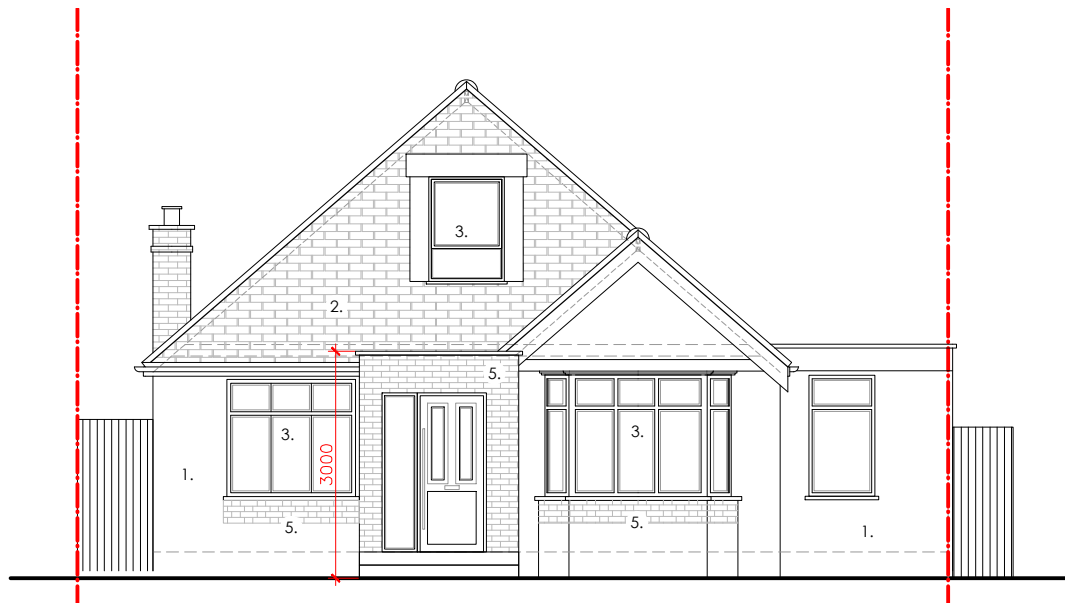
01 PROPOSED FRONT ELEVATION