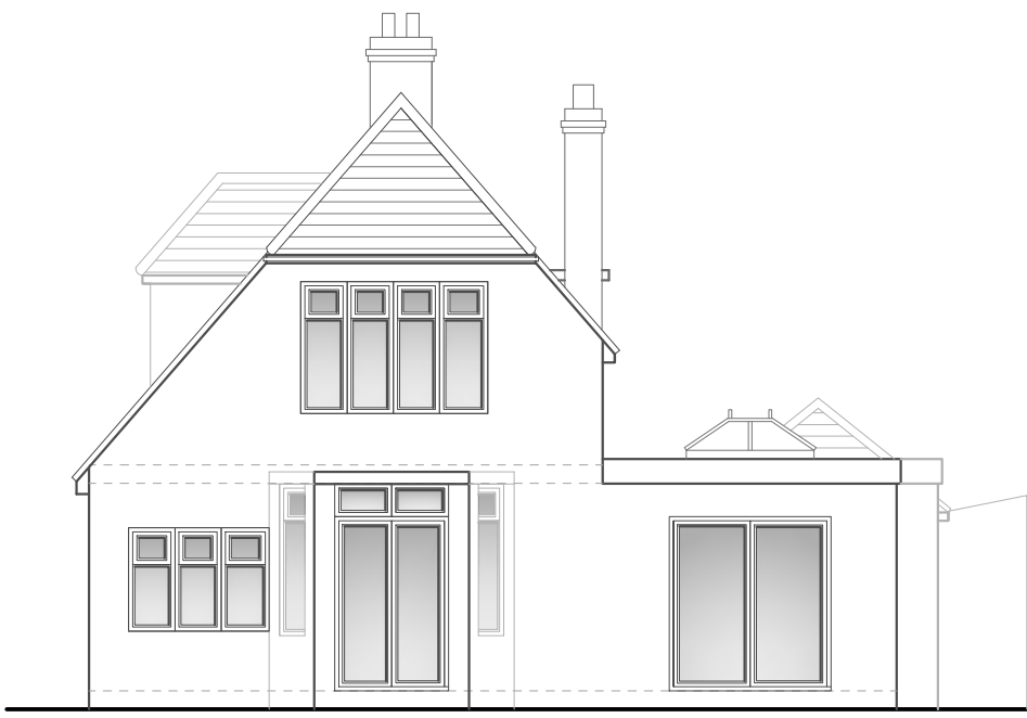
Rear Elevation (Scale 1:100)