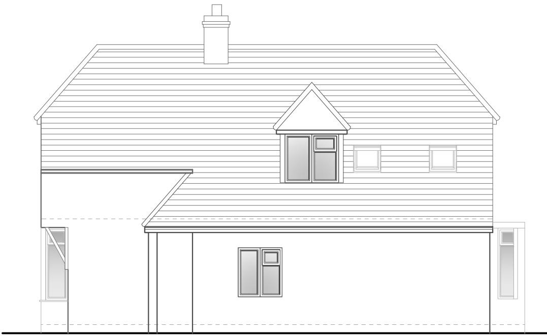
Side Elevation (Scale 1:100)