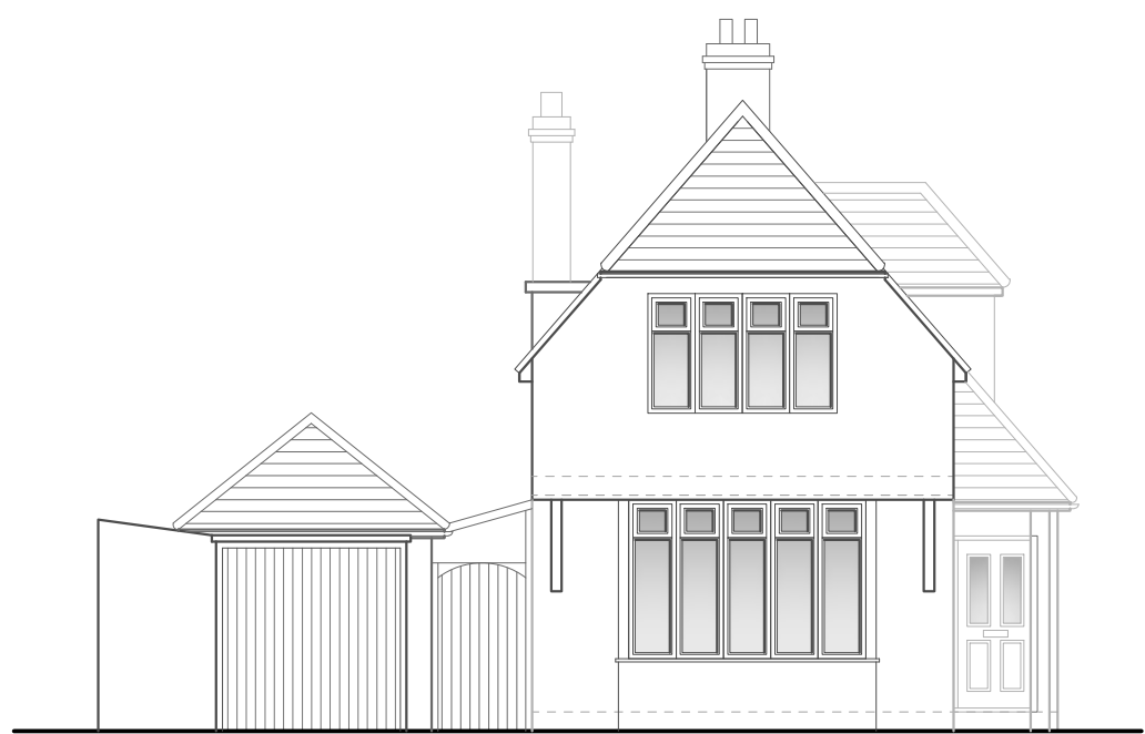
Front Elevation (Scale 1:100)