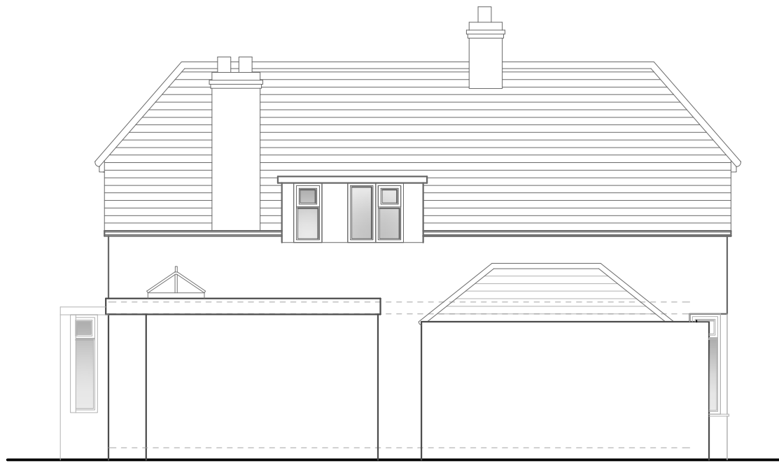
Side Elevation (Scale 1:100)