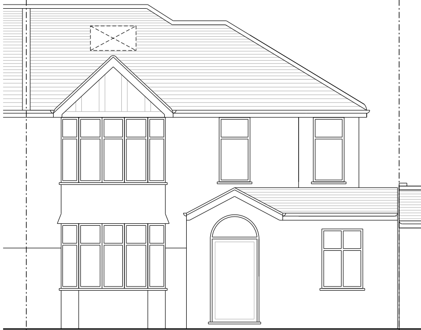
1. PRE-EXISTING FRONT ELEVATION