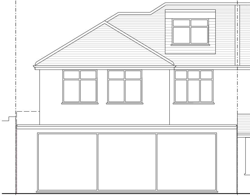
2. PRE-EXISTING REAR ELEVATION