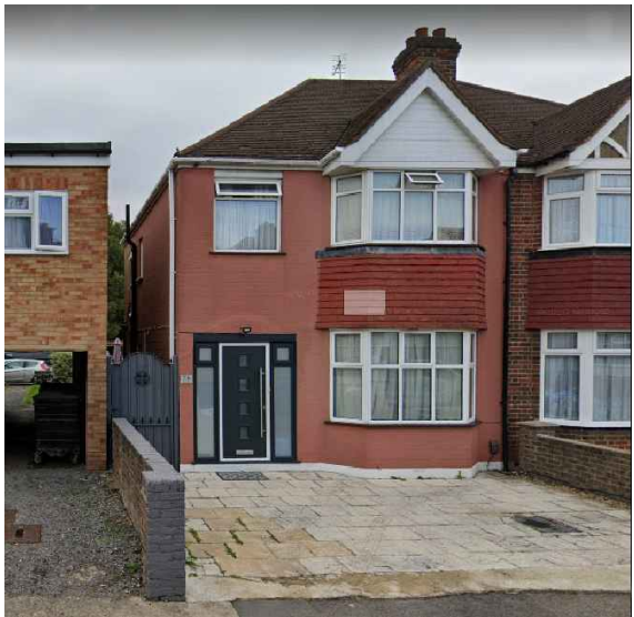
01 - FRONT VIEW