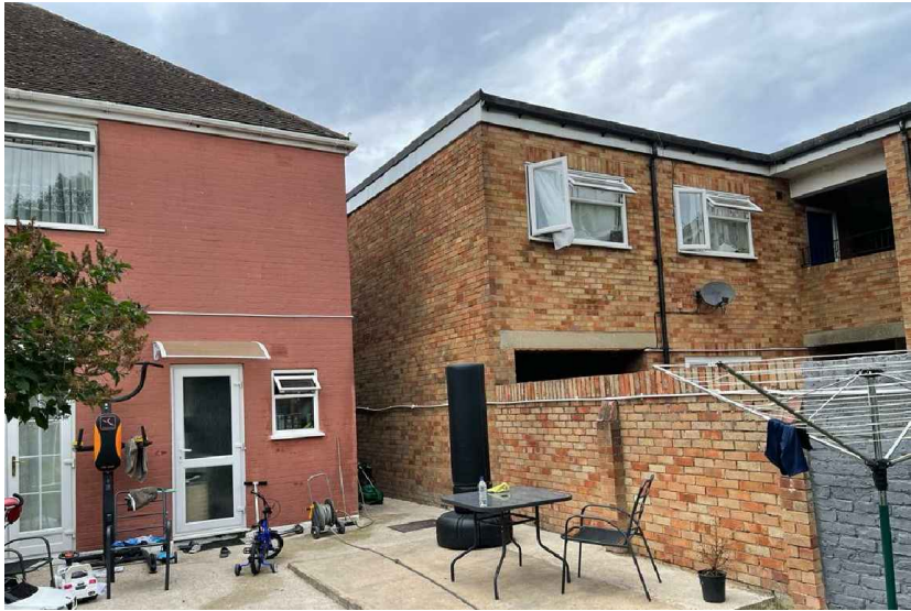
03 - REAR VIEW