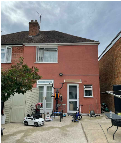
02 - REAR VIEW