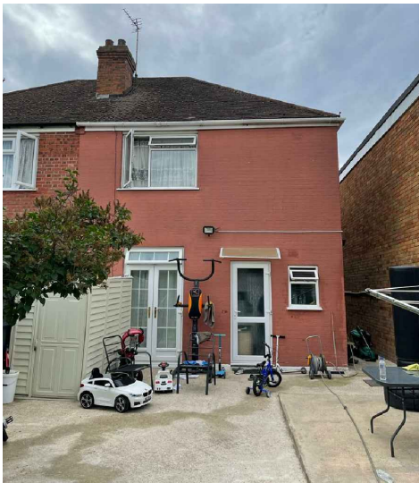
03 - REAR VIEW