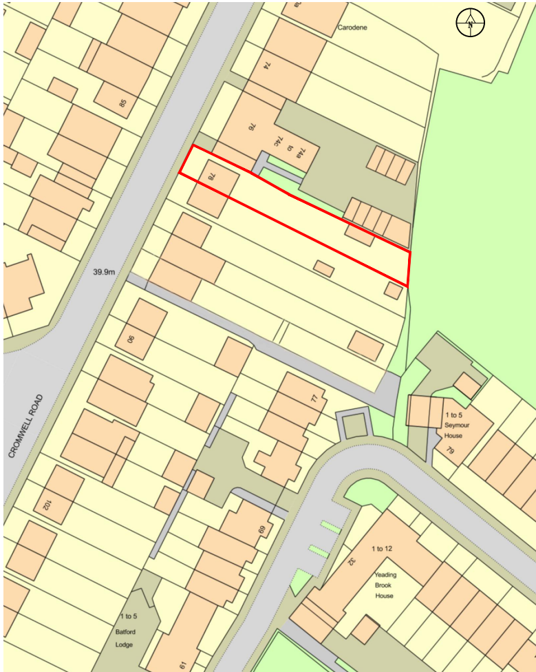
04 - OS MAP SCALE 1:1250