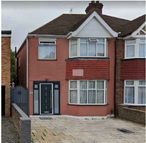
01 - FRONT VIEW