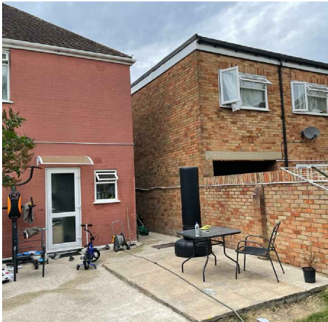
02 - REAR VIEW