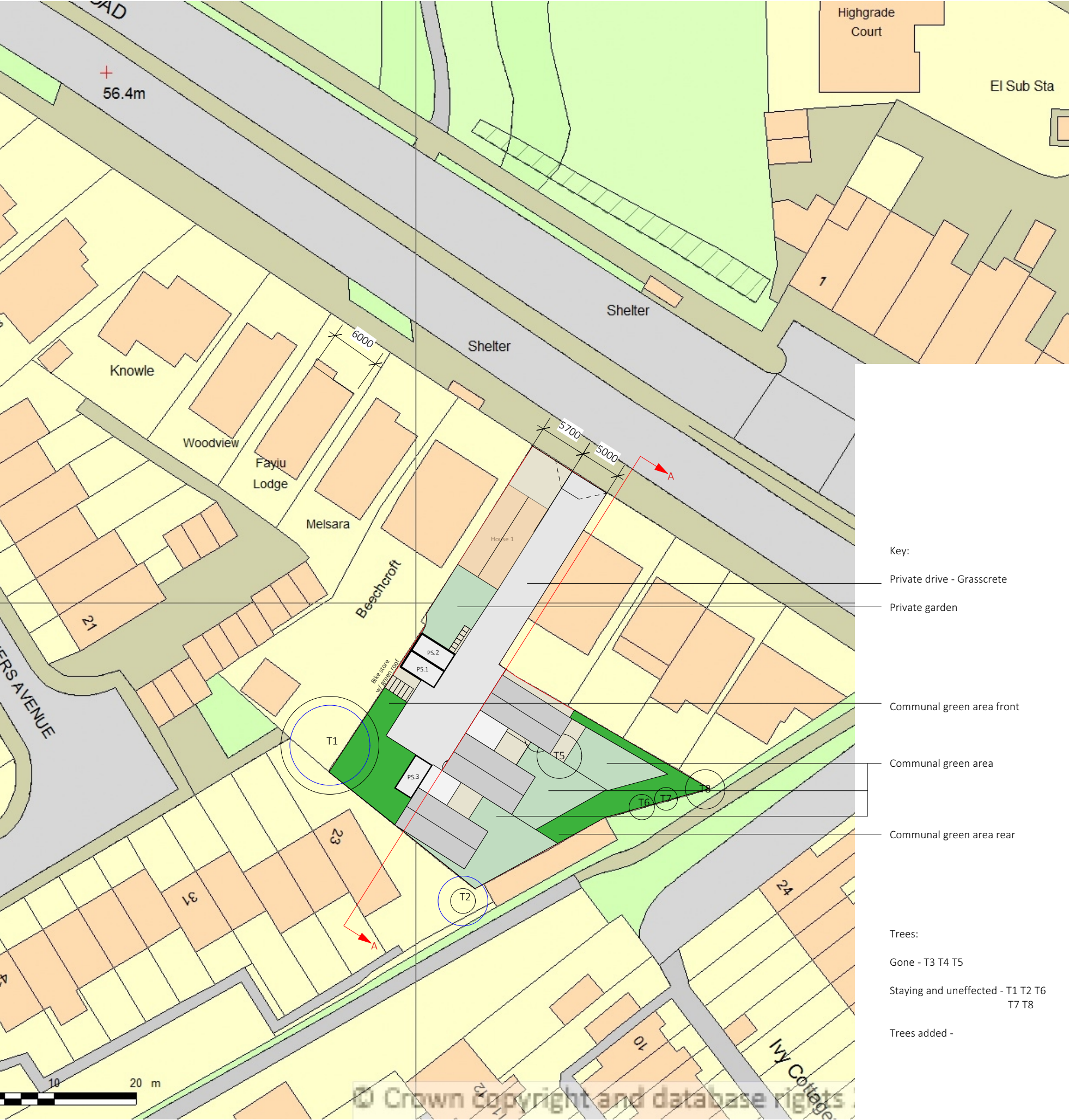
4no. 2 bedroom houses with smaller (driveway style access to the rear)