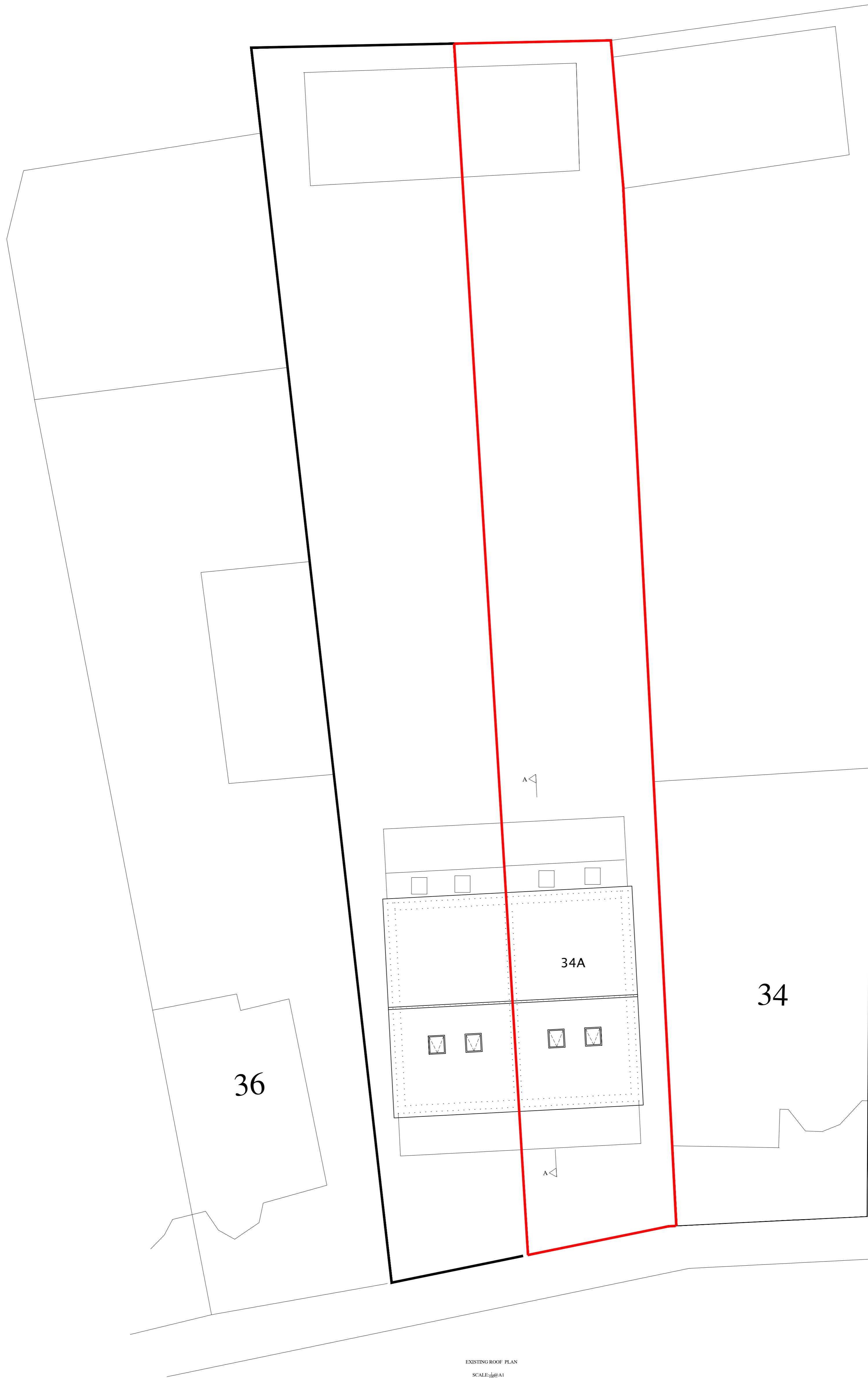
EXISTING ROOF PLAN SCALE: 1/100@A1