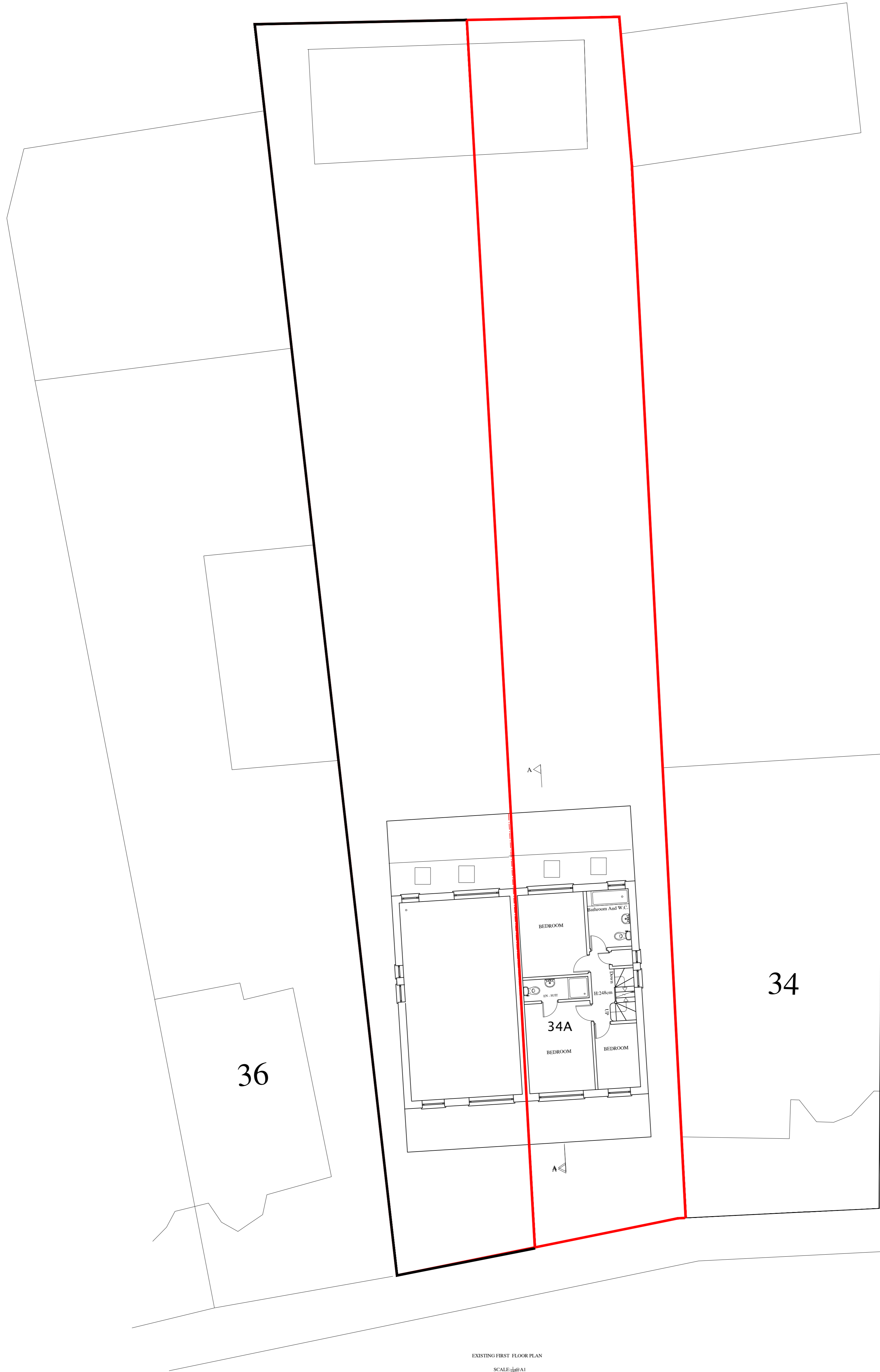
EXISTING FIRST FLOOR PLAN SCALE: 1/100@A1

PLANNING USE ONLY. STRUCTURAL SURVEY IS STILL REQUIRED