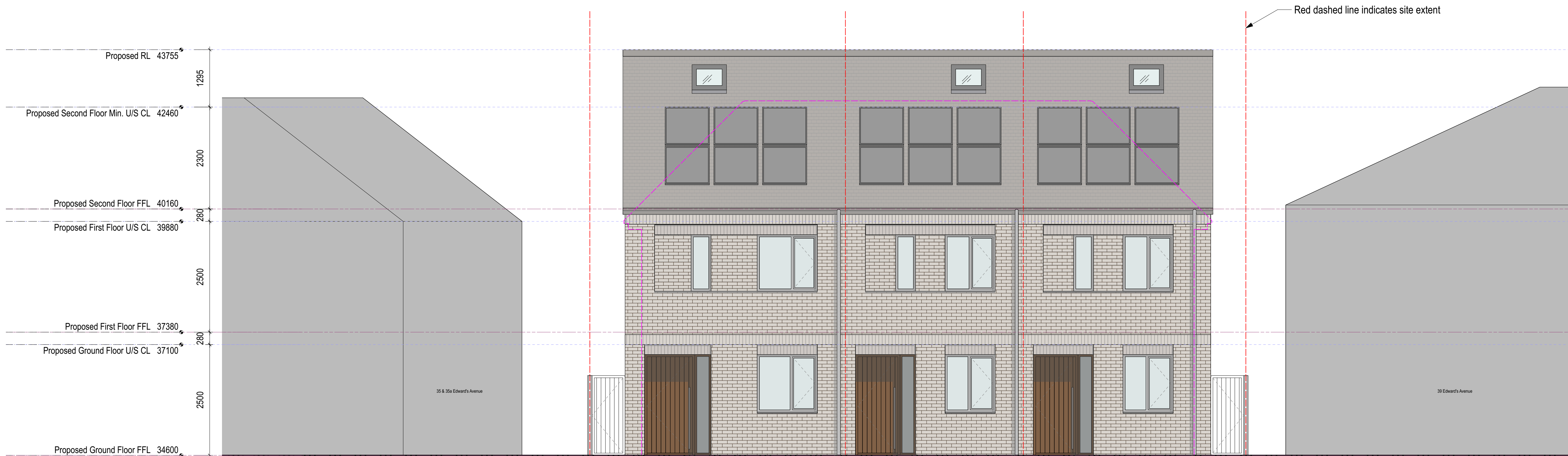
02 - Proposed Streetscene Scale 1:50@A1 / 1:100@A3