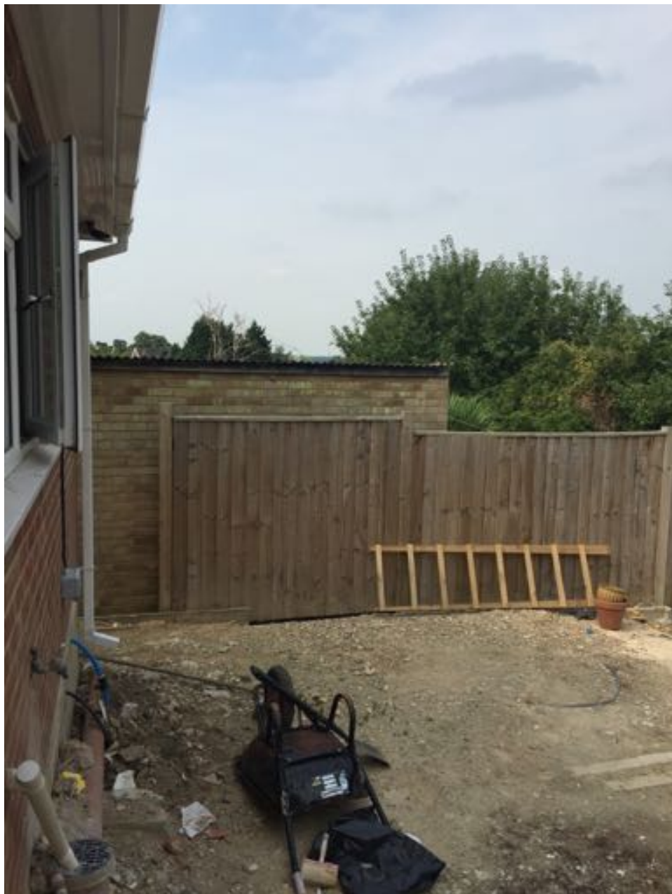
View from Back door of 17 Maylands Drive