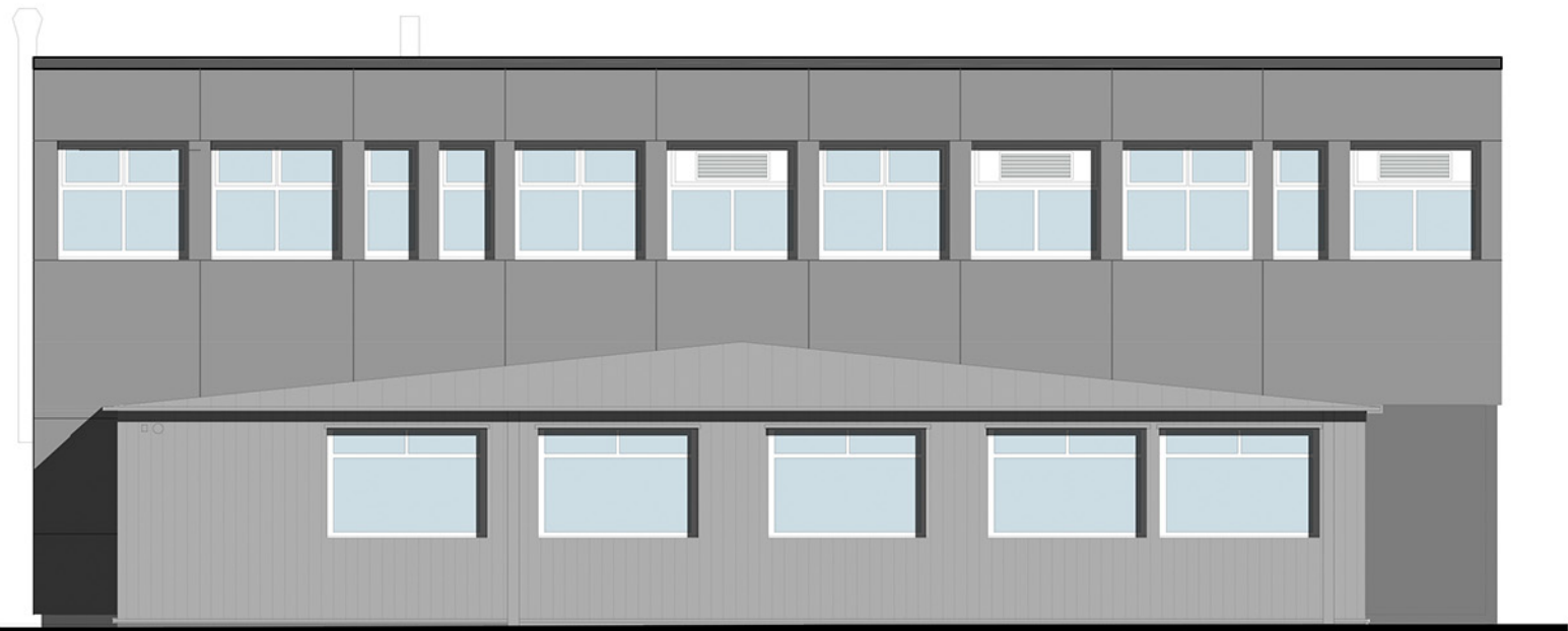
West Elevation 2