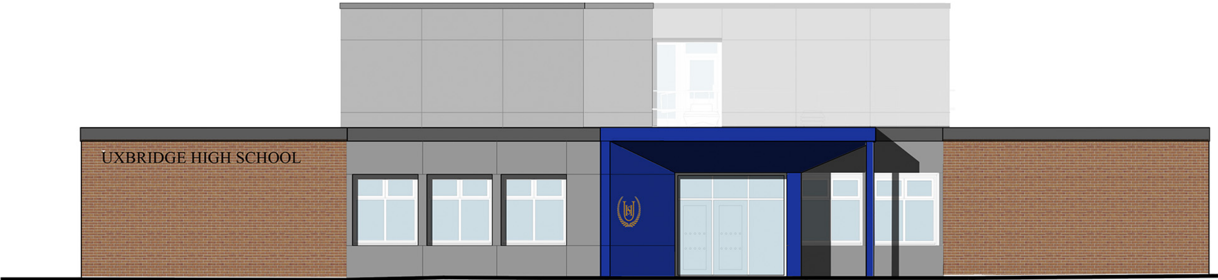
North Elevation 1

general notes: do not scale from the drawing, all dimensions shall be checked on site prior to commencing works. all works shall conform to the current edition of the building regulations and other relevant statutory requirements. all materials and workmanship shall conform with the relevant british standard specifications and codes of practice. this drawing is the copyright of gdm architects and shall not be copied or reproduced without permission. this drawing shall be read in conjunction with gdm architect's health and safety risk assessments and all works shall be carried out in a safe manner, by competent persons. drawing produced by gdm architects ltd trading as gdm architects. revision: details: by: date: P1 First Issue gl 24.04.2025