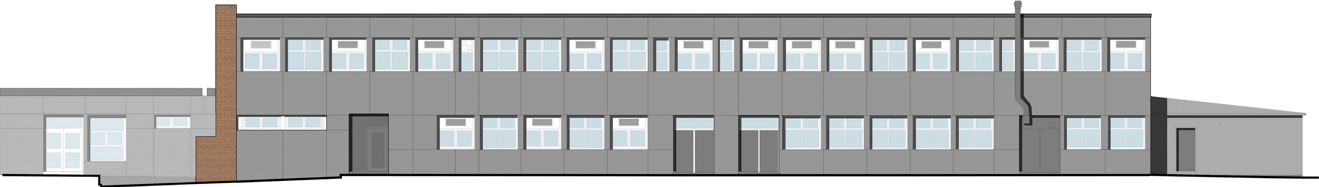
North Elevation 2