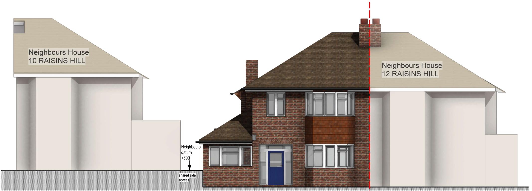
01 01 PROP ELEV FRONT Scale: 1:100