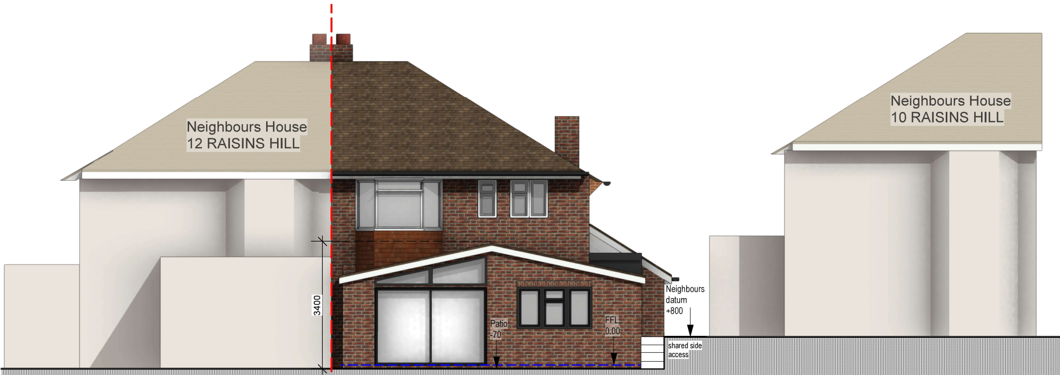
02 02 PROP ELEV REAR Scale: 1:100