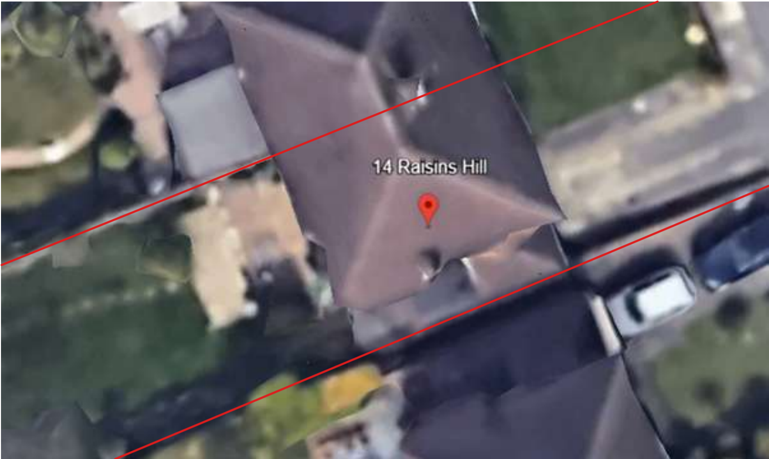
AERIAL VIEW Site shown in red