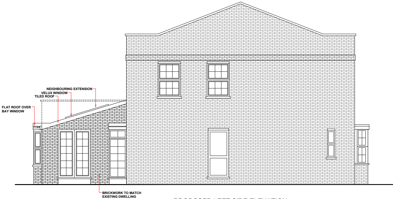
PROPOSED LEFT SIDE ELEVATION