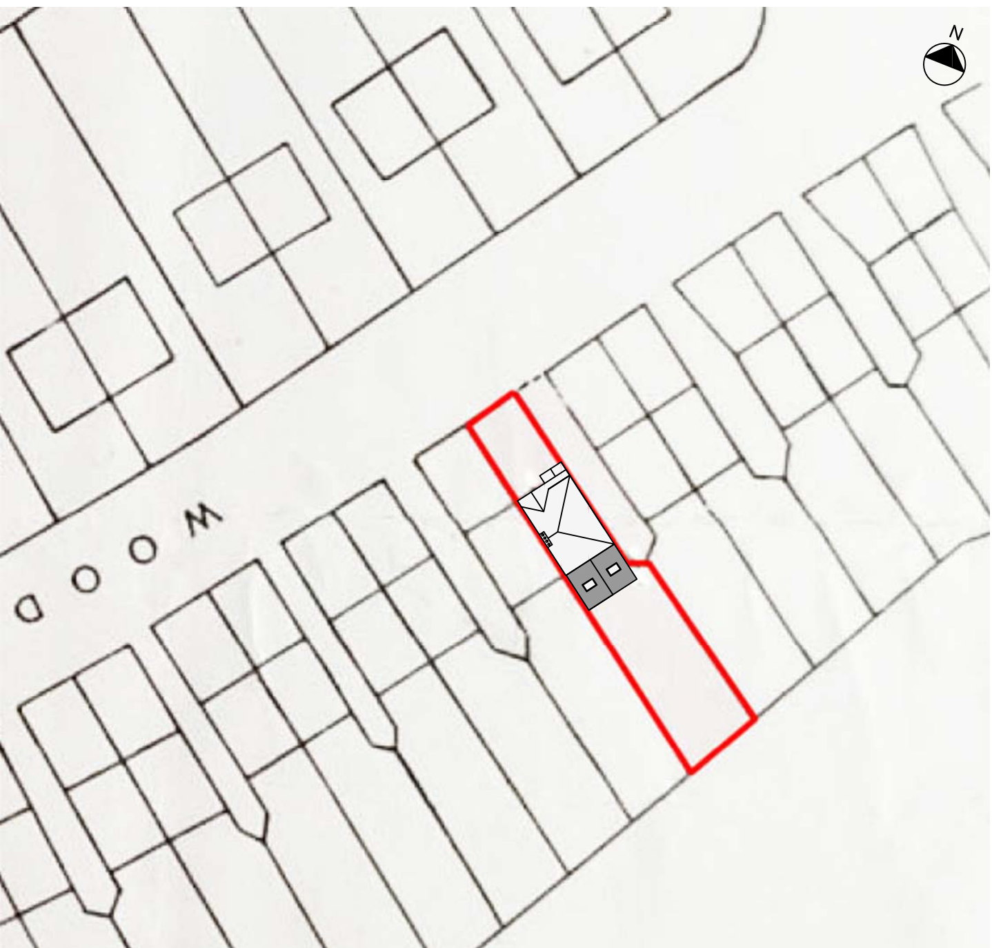
PROPOSED BLOCK PLAN SCALE 1:500 @ A3