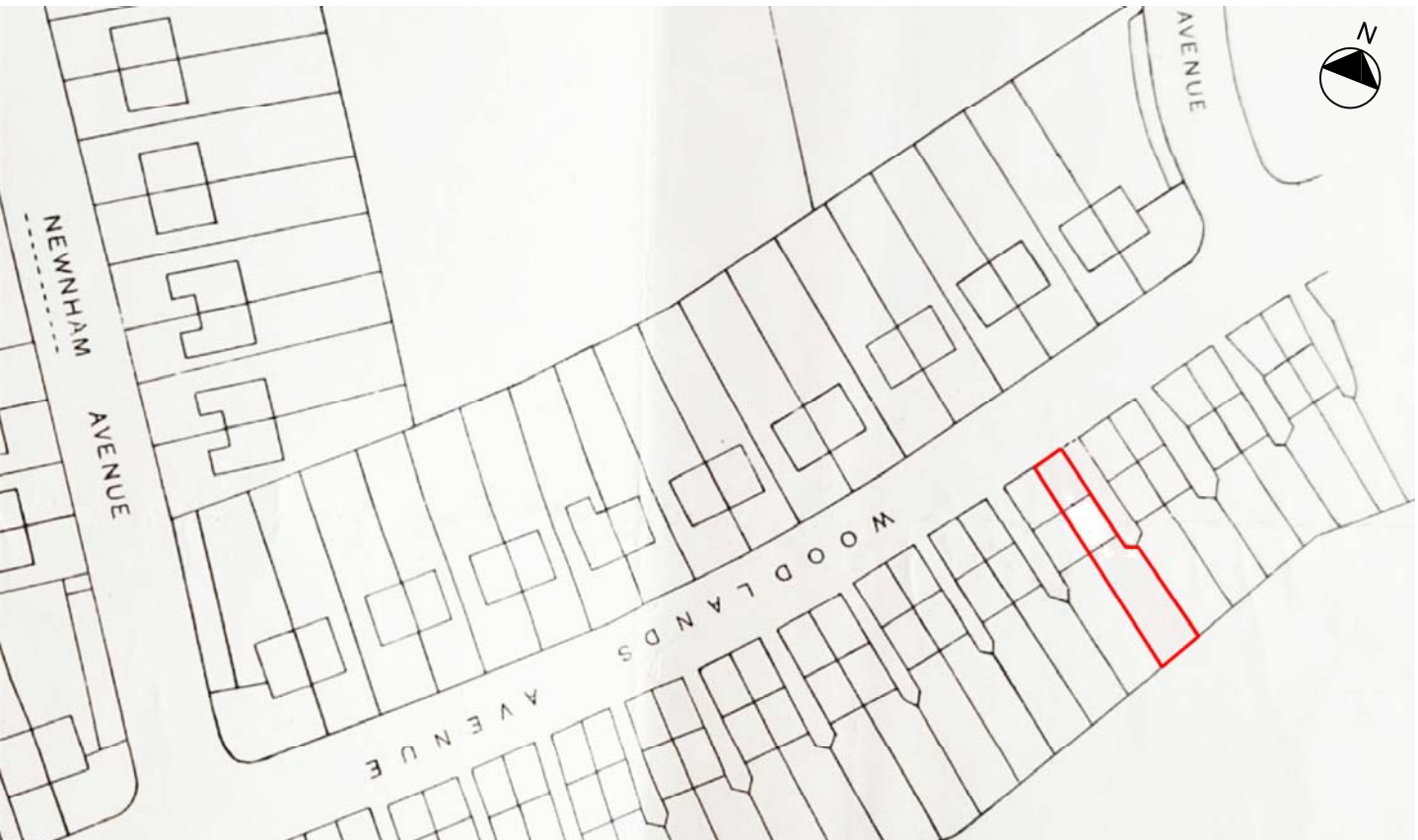
SITE LOCATION PLAN SCALE 1:1250 @ A3