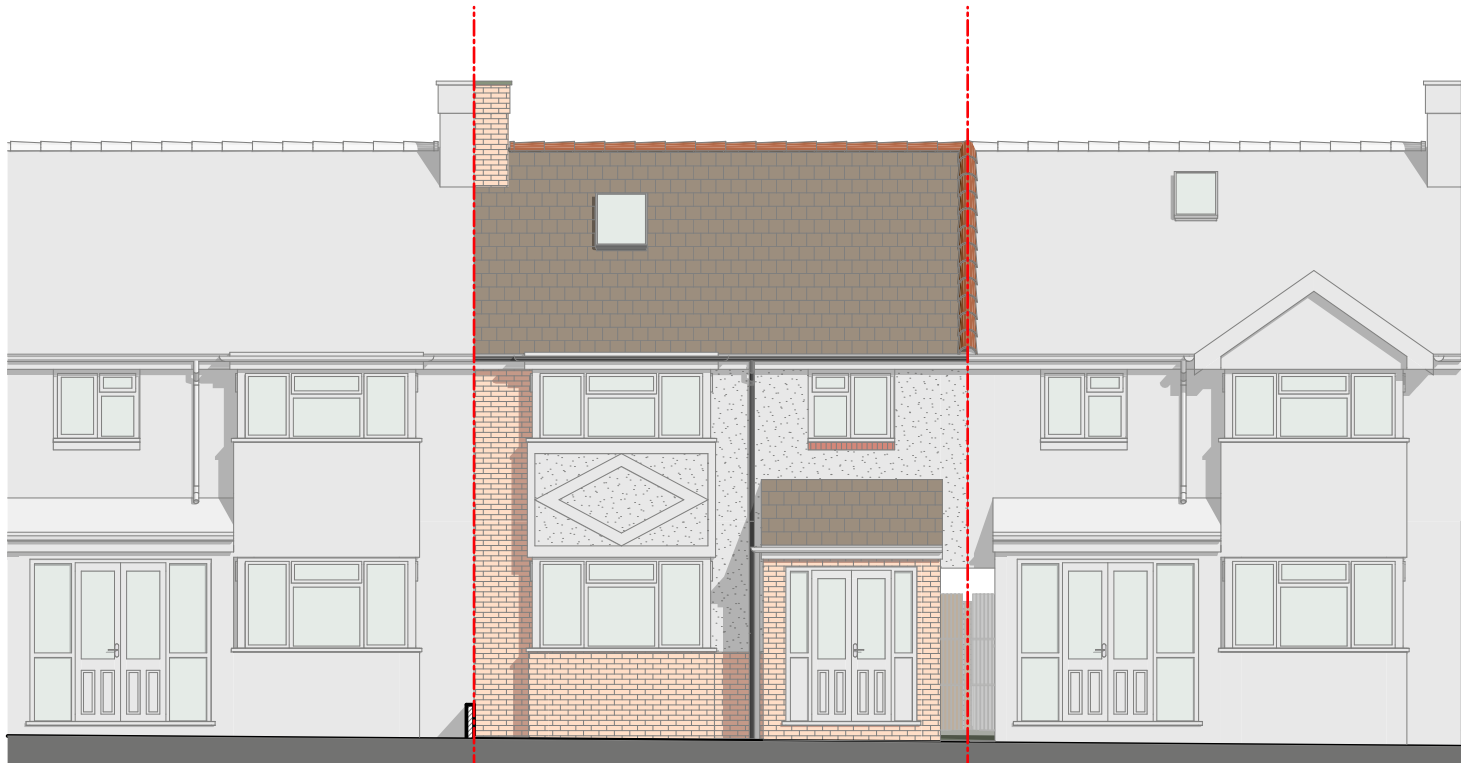
Front Elevation 1:100