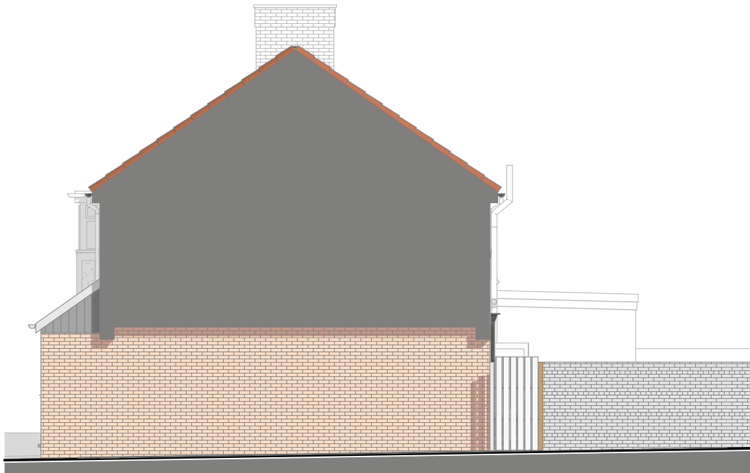
North-West Elevation 1:100