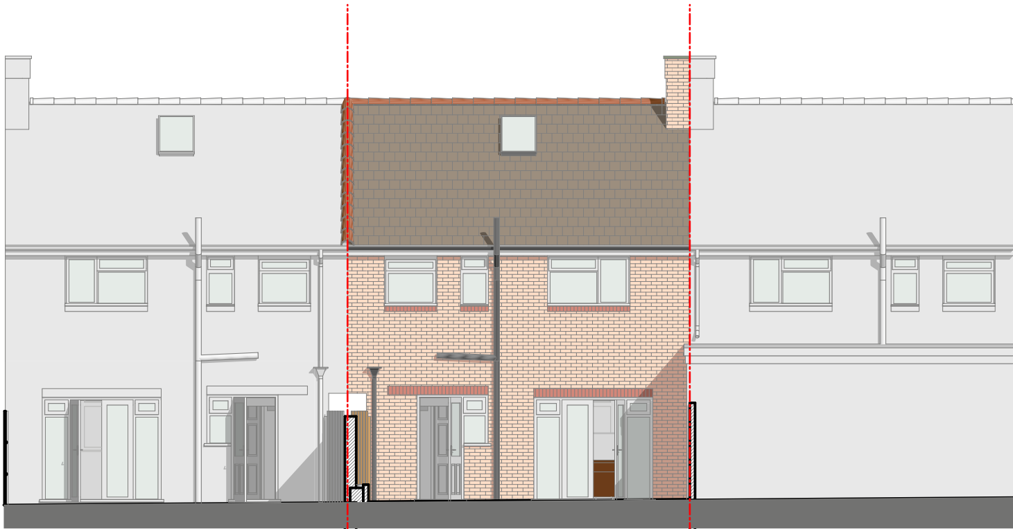
Rear Elevation 1:100