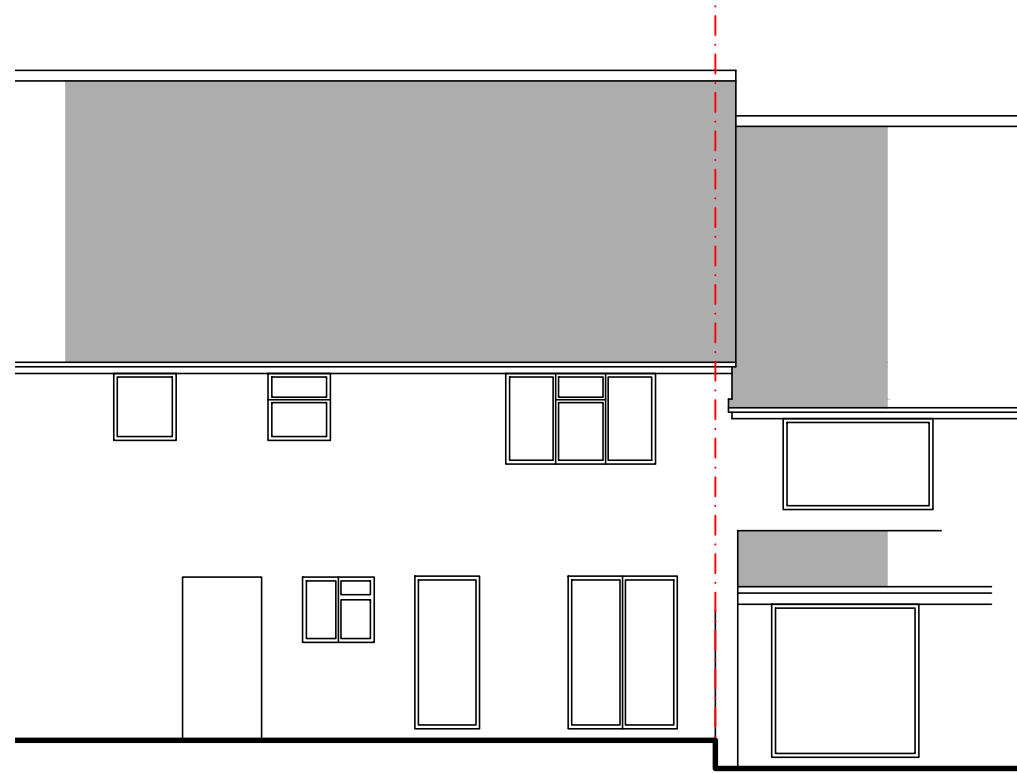
Rear Elevation scale 1:100