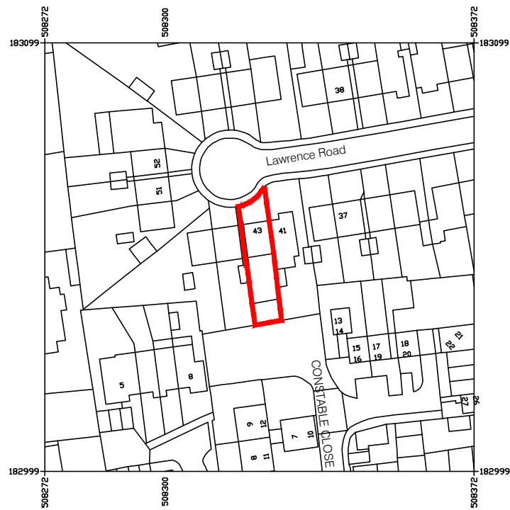
Location Plan scale 1:1250