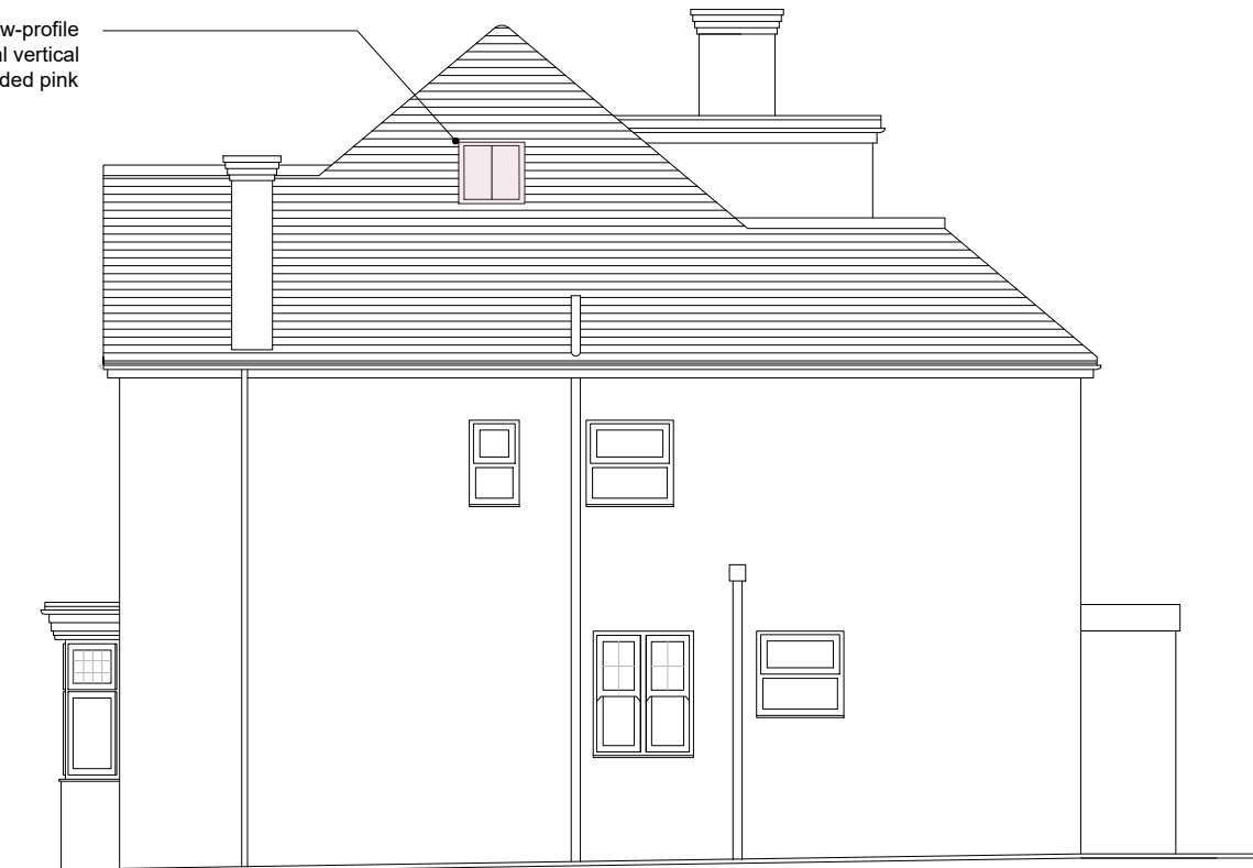
02 Proposed Side Elevation 6aHR_109 SCALE: 1:100

New conservation low-profile rooflight with central vertical glazing bar shaded pink