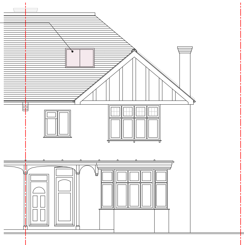
01 Proposed Front Elevation 6aHR_109 SCALE: 1:100

New conservation low-profile rooflight with central vertical glazing bar shaded pink