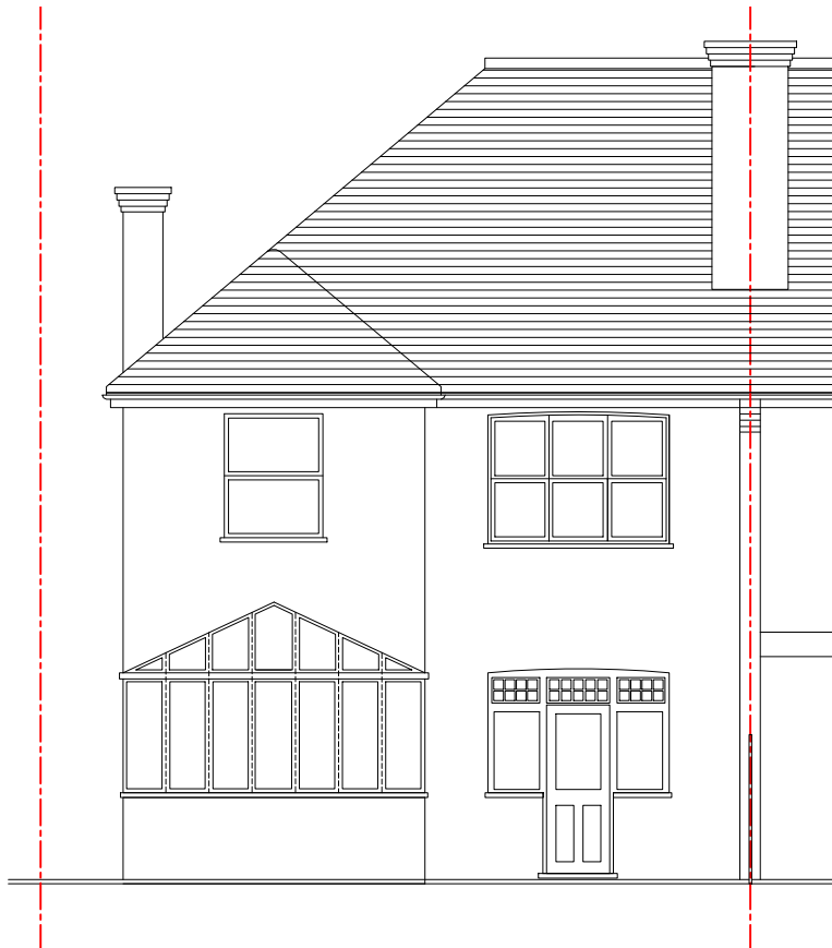
03 Existing Rear Elevation 6aHR_104 SCALE: 1:100