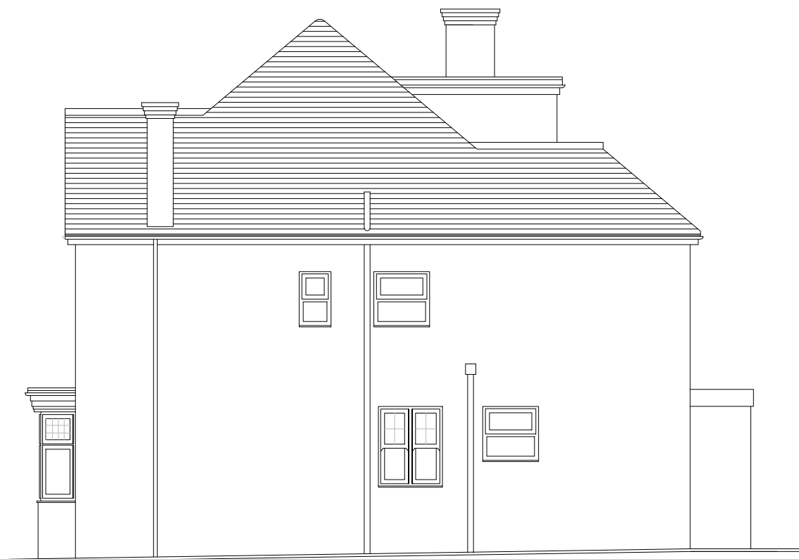
02 Existing Side Elevation 6aHR_104 SCALE: 1:100