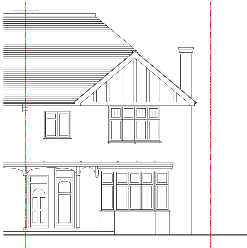
01 Existing Front Elevation 6aHR_104 SCALE: 1:100