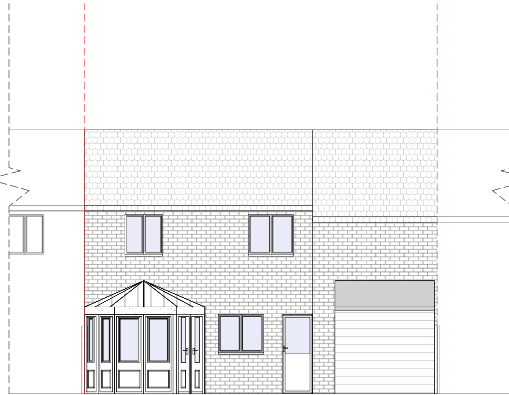
Existing South Elevation