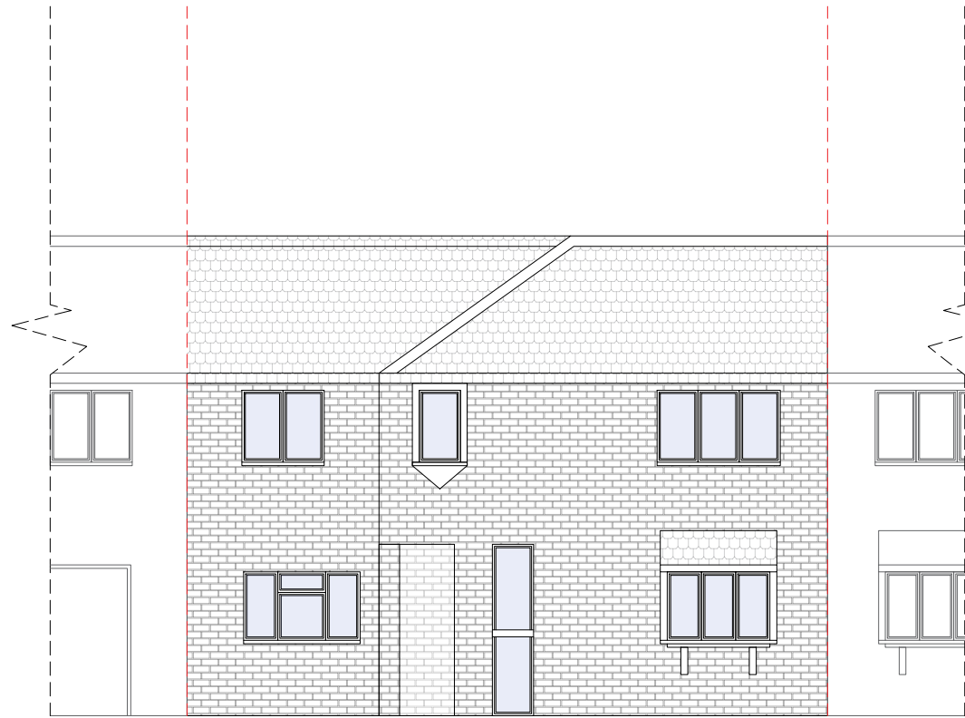
Existing North Elevation