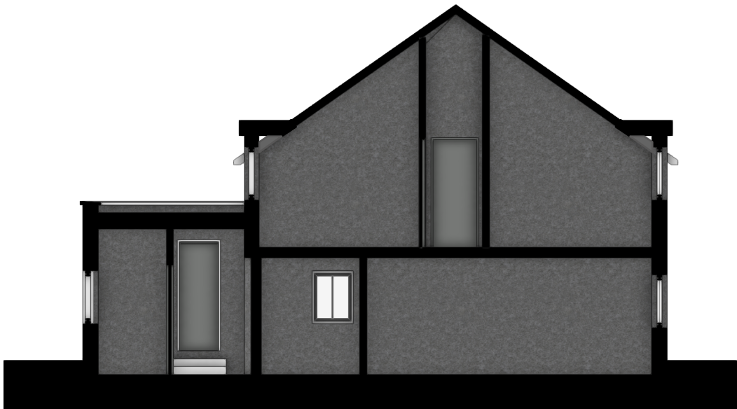
2 SECTION B-B Scale: NTS