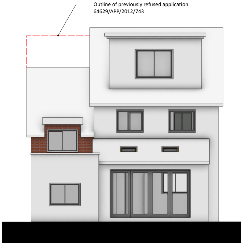
8 SOUTH (rear)