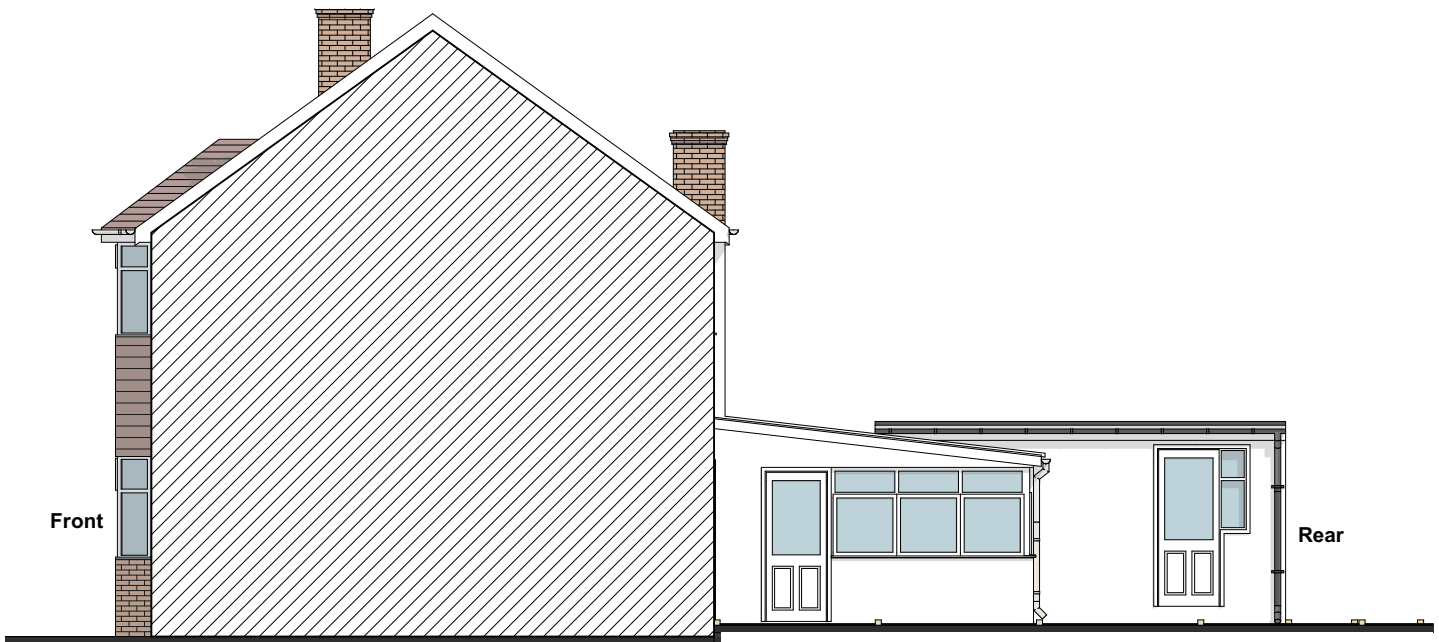
Existing Flank Elevation 1:100

COPYRIGHT: The contents of this drawing may not be reproduced in whole or in part without express written consent of ARKSS Design Limited.