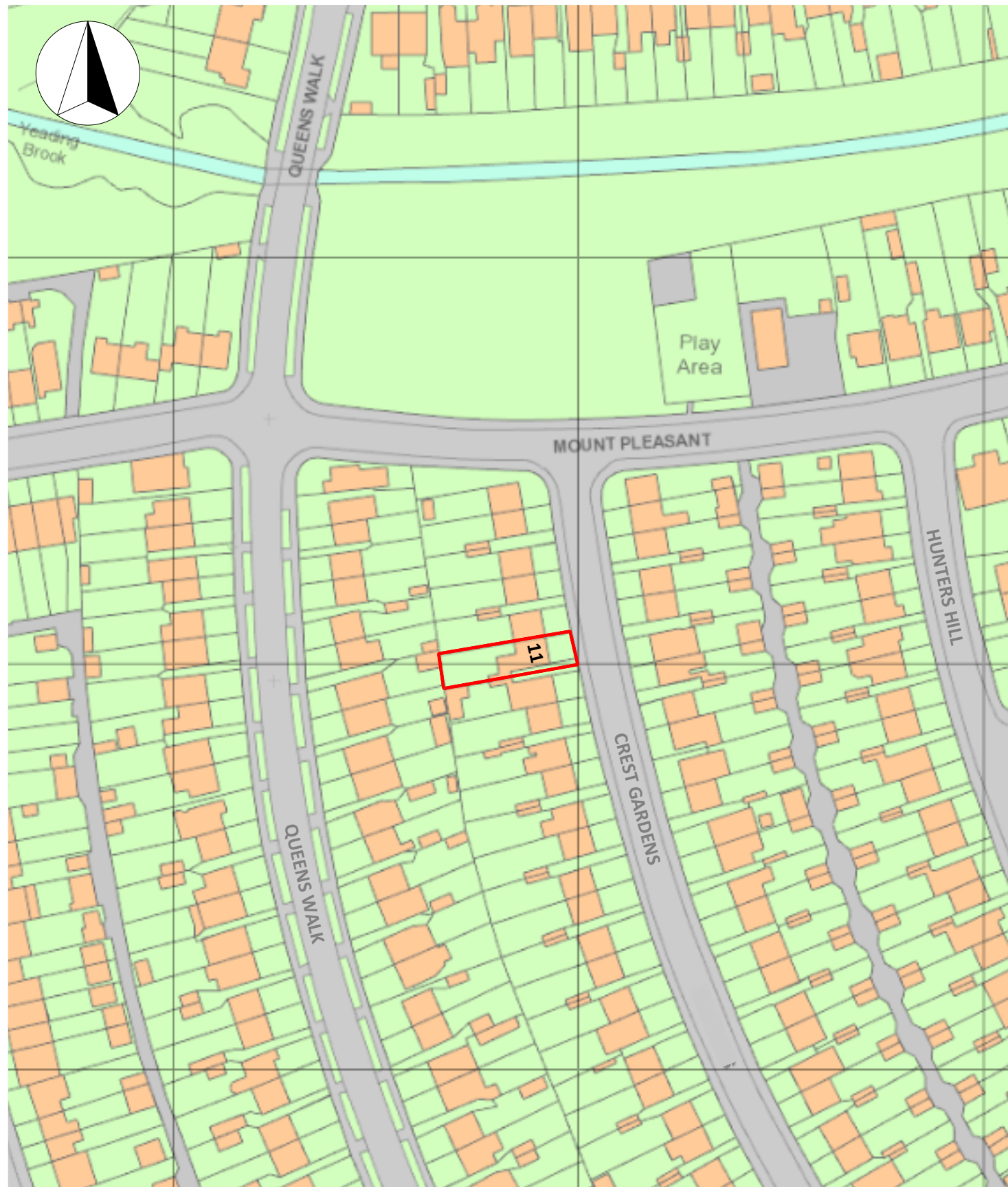
LOCATION MAP scale 1:1250

0 12.5 25 37.5 50 62.5 M Meters @ 1:1250 @ A3