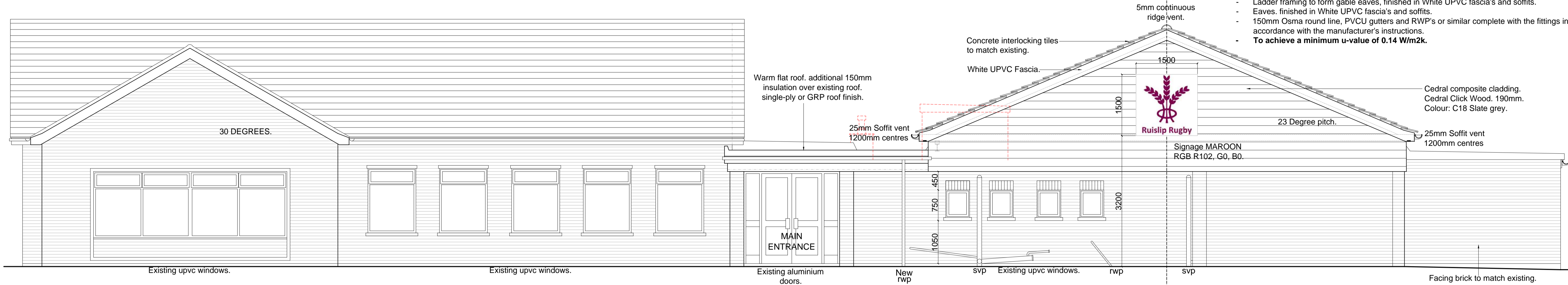
PROPOSED FRONT ELEVATION (EAST FACING)