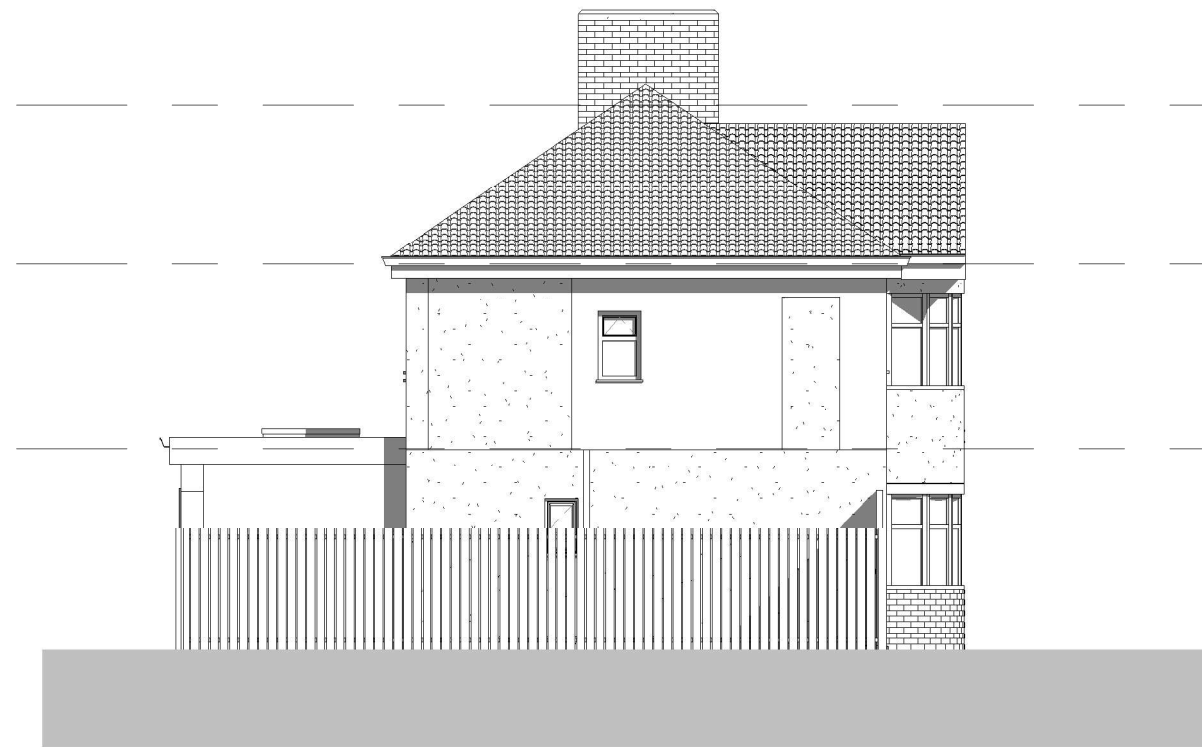
1 West elevation - Existing 1 : 100