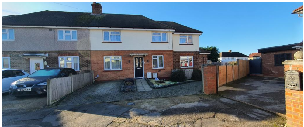
Image 4. 17, South Close, Front elevation

This current application proposal including car parking arrangements is very similar / identical in all respects to this approved and built (see images 4, 5, and 6) under the recent Planning Permission to 17, South Close, West Drayton, London, UB7 9L (Application ref.: 66804/APP/2014/3811), and we therefore assume that will be acceptable.