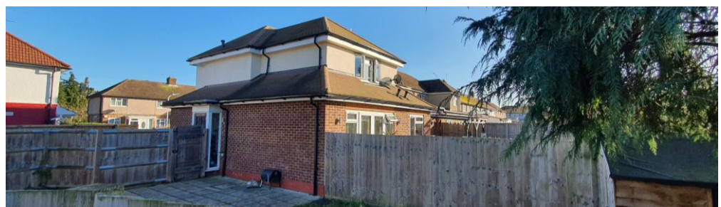
Image 5. 17, South Close, Rear / Side elevation