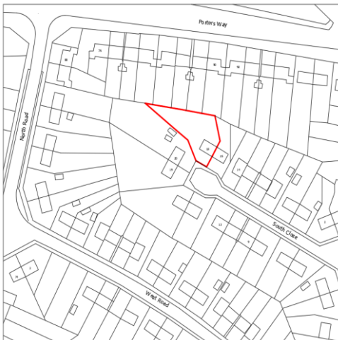
Image 1. Location plan

The application site is located at the end of South Close, a cul-de-sac comprising of some twenty semi-detached two storey dwelling houses, all of which are of similar age and design.