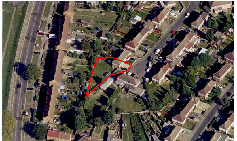
Image 2. Aerial View