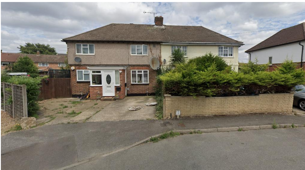
Image 3. Front elevation of 18, South Close