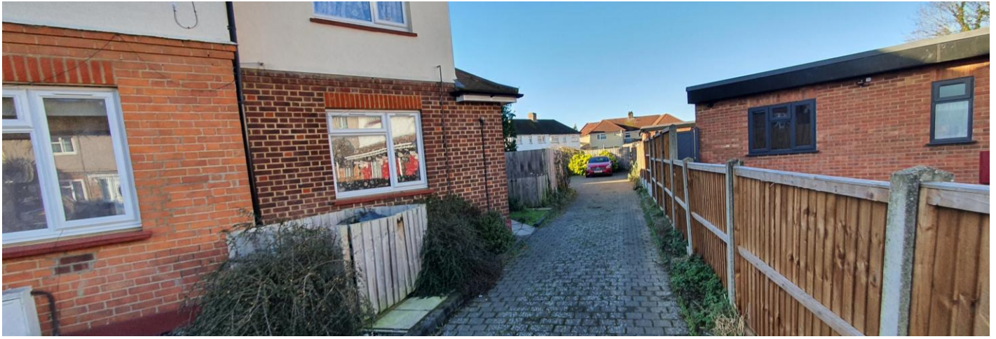
Image 6. 17, South Close, Side road view