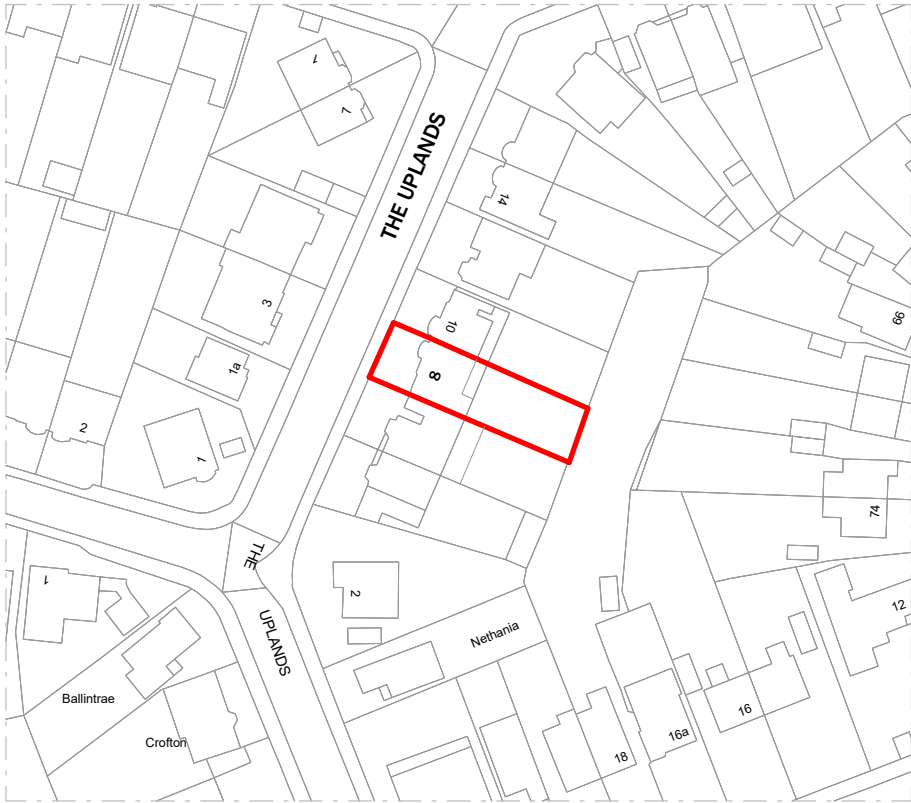
Location Plan [1:1250]