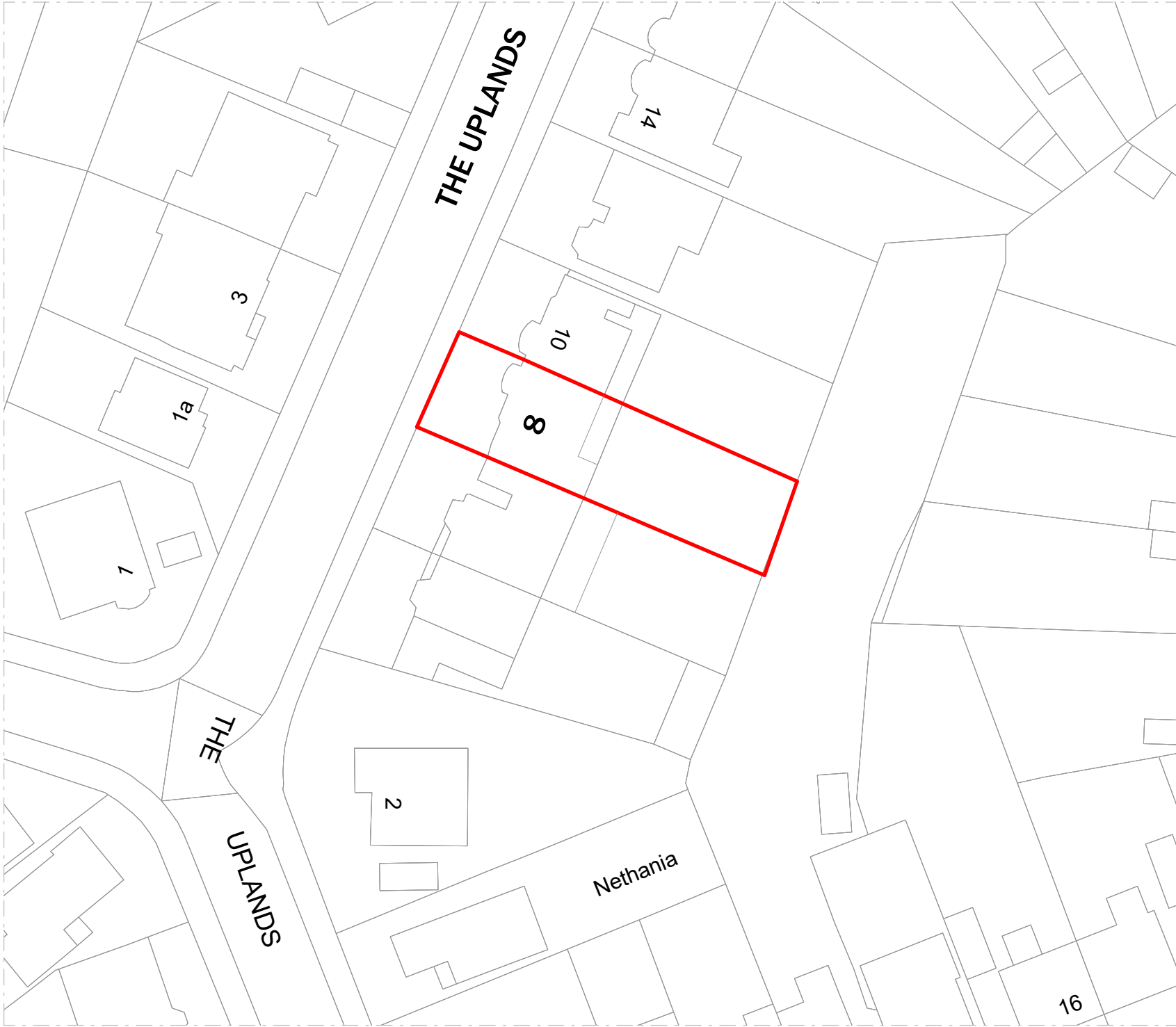
Block Site Plan [1:500]