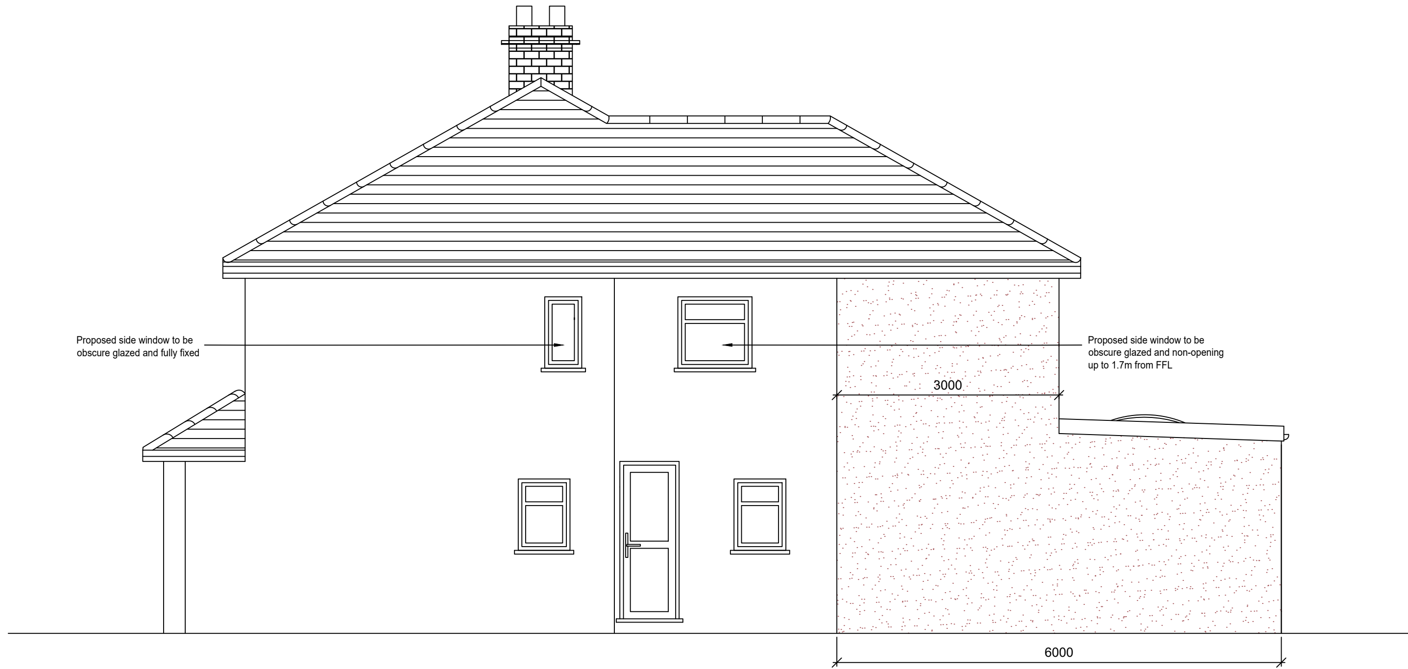
Proposed Side Elevation Scale 1 : 50