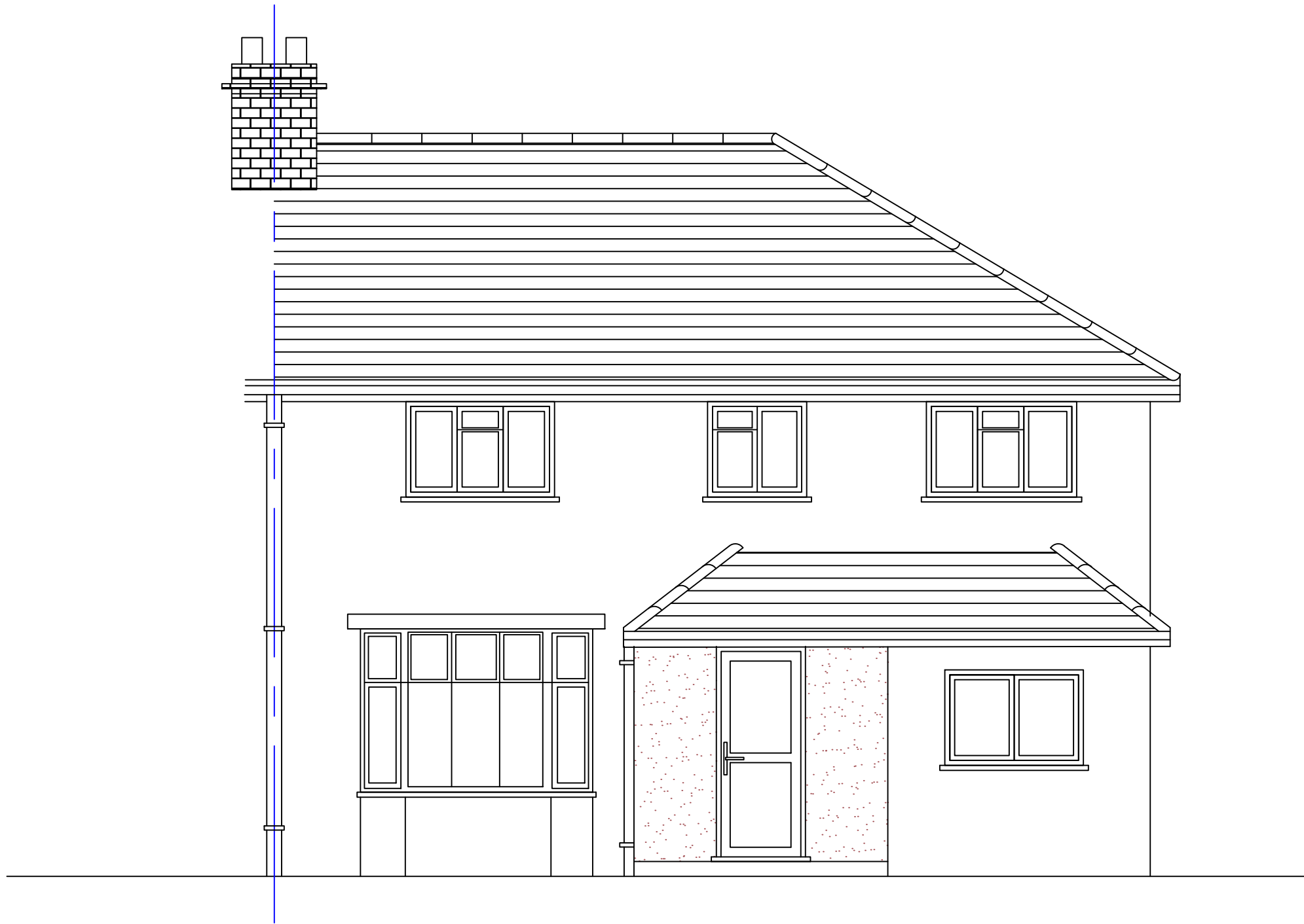
Proposed Front Elevation Scale 1 : 50