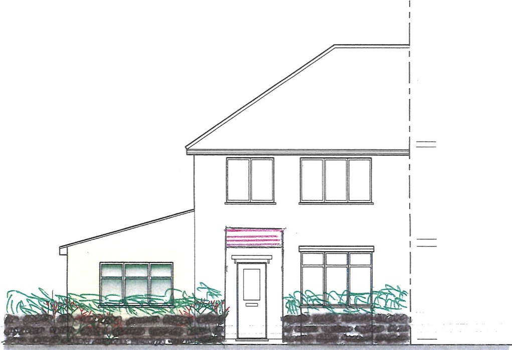
Existing Front Elevation 1:100@A3