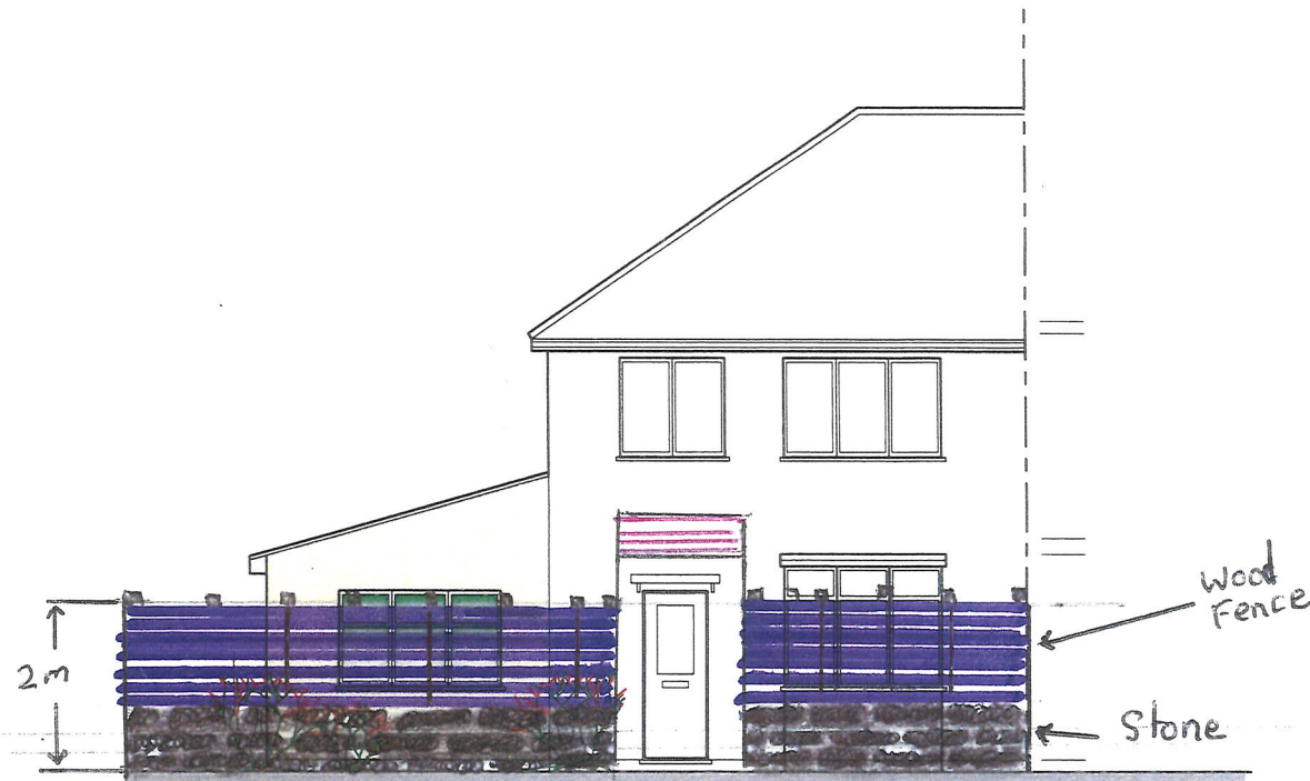
PROPOSED FRONT ELEVATION 1:100@A3