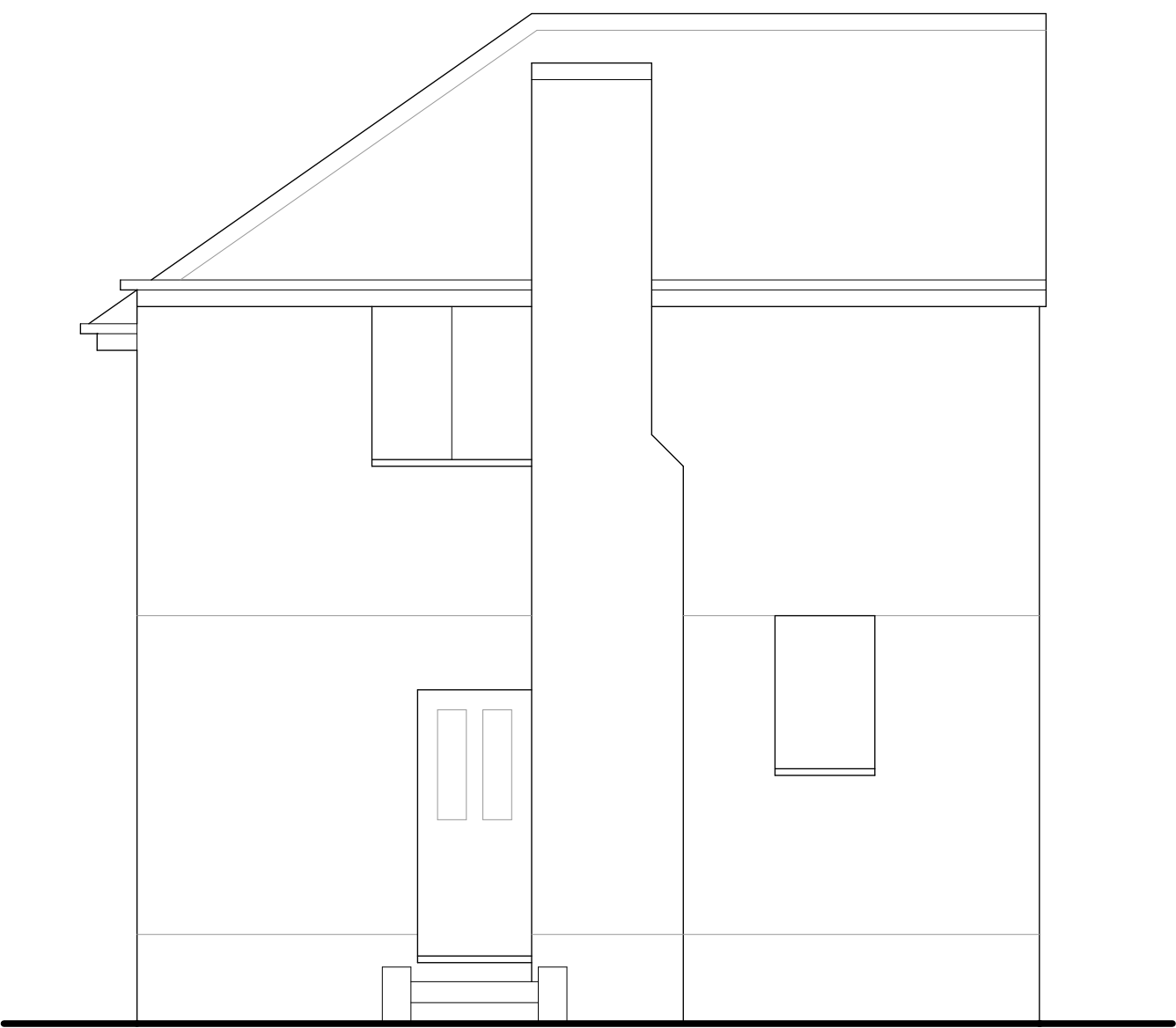
SIDE ELEVATION west