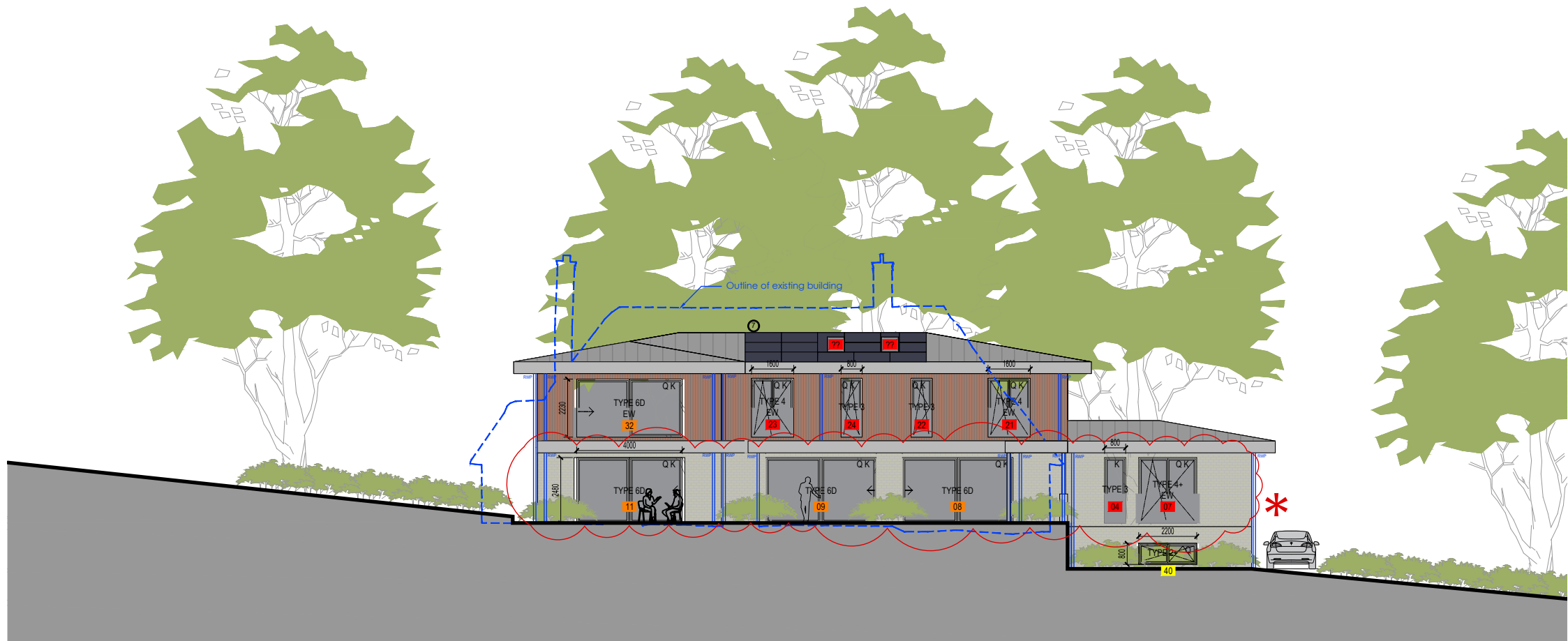
Elevation South West