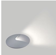
LOGIC F1: Delta LED Logic 2W Path marker - Alluminium