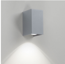
MONO II :Delta Mono II LED 930 wall light