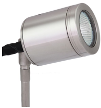
LGC1063 : Collingwood LED spike spot - 2.2W s/steel