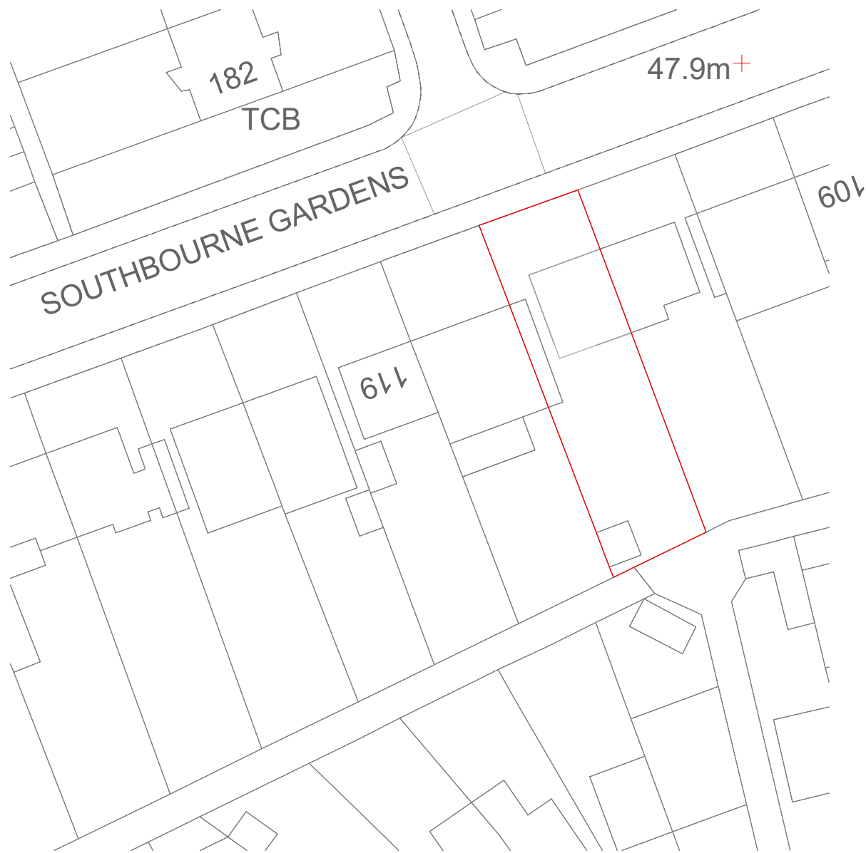
1 Block Plan Existing 1 : 500