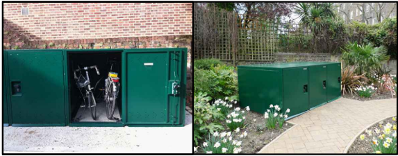
Double bike locker by Cyclehoop

Notes - This drawing is for town planning purposes only. It is not to be used for construction or any other purpose. - The client is responsible for obtaining all statutory provisions including Building Regulations approval, works under the Party Wall Act 1996, and CDM Regulations 2015. - Any figured dimensions are based on limited survey information. All dimensions are to be verified by the contractor prior to the commencement of works. Any discrepancies to be reported immediately. - Any other discrepancies or omissions to be reported immediately