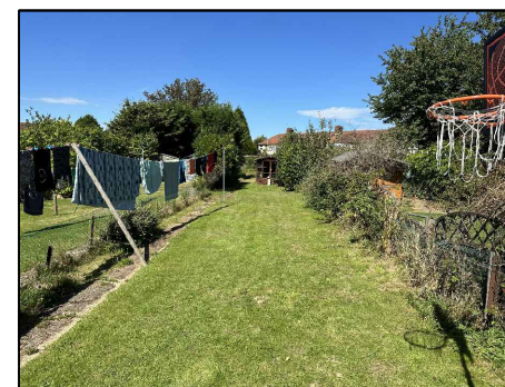
Rear garden of 98 Waltham Avenue