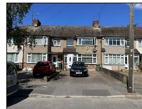
Front view of 98 Waltham Avenue