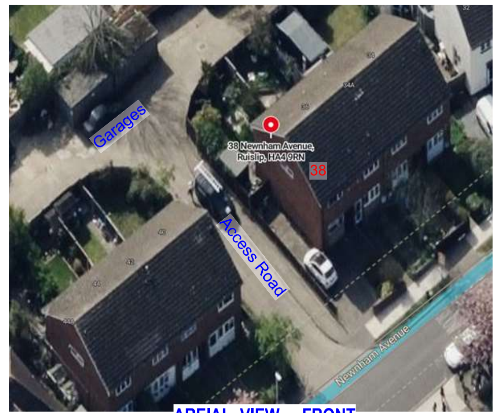
AREIAL VIEW - FRONT showing application property and neighbouring properties.