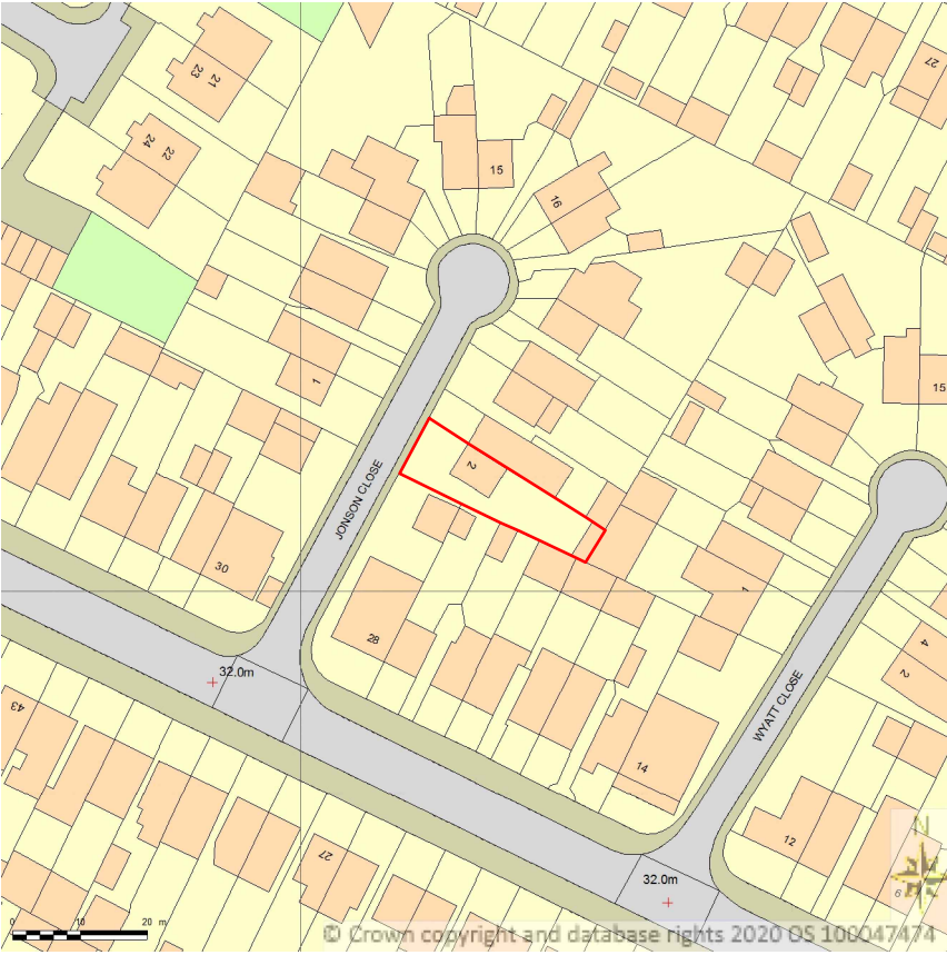
Location Plan@ 1:1250

Retrospective Planning Application for Hip to Gable roof of Double storey side extension and Front Porch