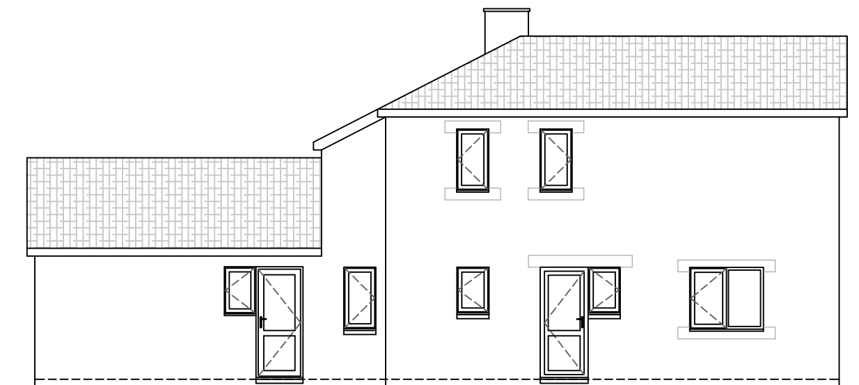
LEFT-HAND SIDE ELEVATION

Notes: These drawings are the property of Anglian Home Improvements and must not be used, distributed, loaned or copied without the express permission of Anglian Home Improvements. All dimensions are in millimetres (mm) unless noted otherwise. Do not use for base laying purposes Produced on A3 paper