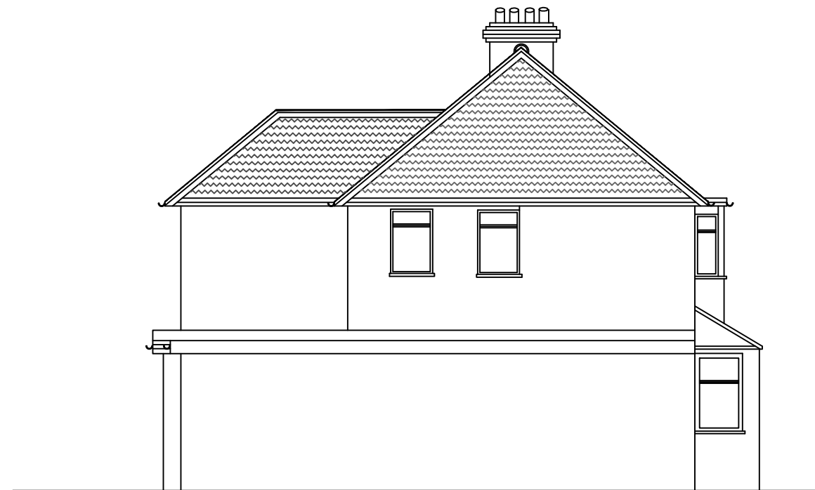
Proposed Side Elevation Looking From No: 26

SCALE: 1: 100 Paper Size A3 0 1 2 3 4 5 6 7 8 9 10