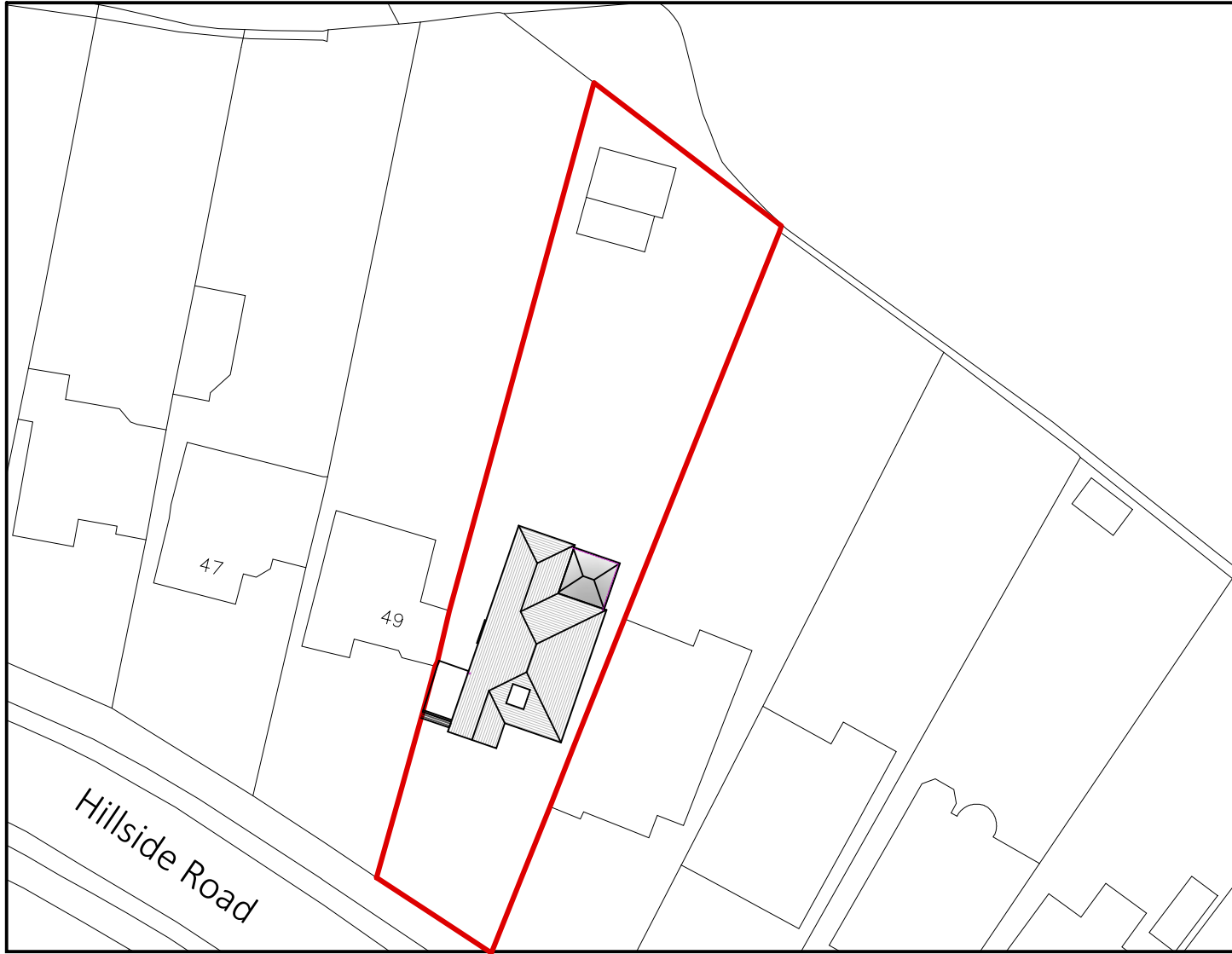
Existing Block Plan Scale 1:500