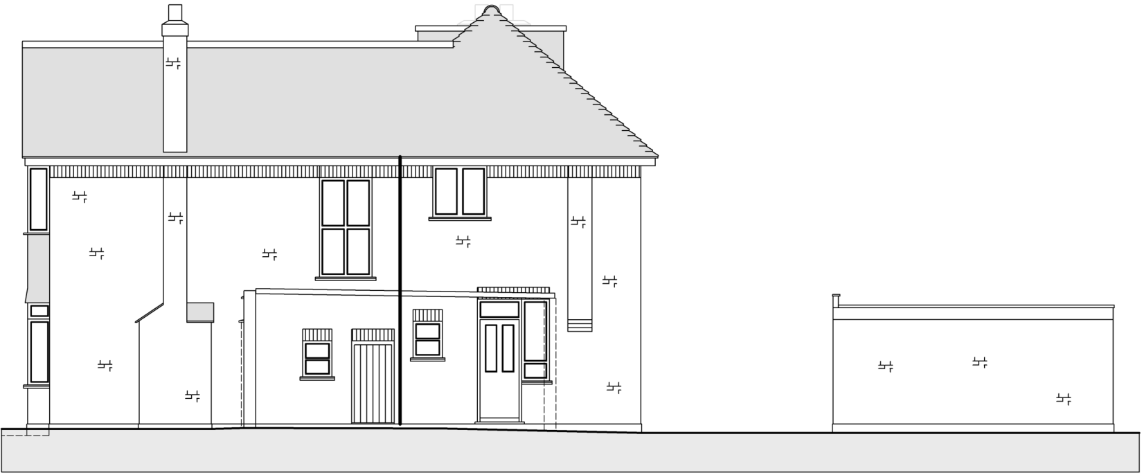
EXISTING DWELLING SIDE ELEVATION