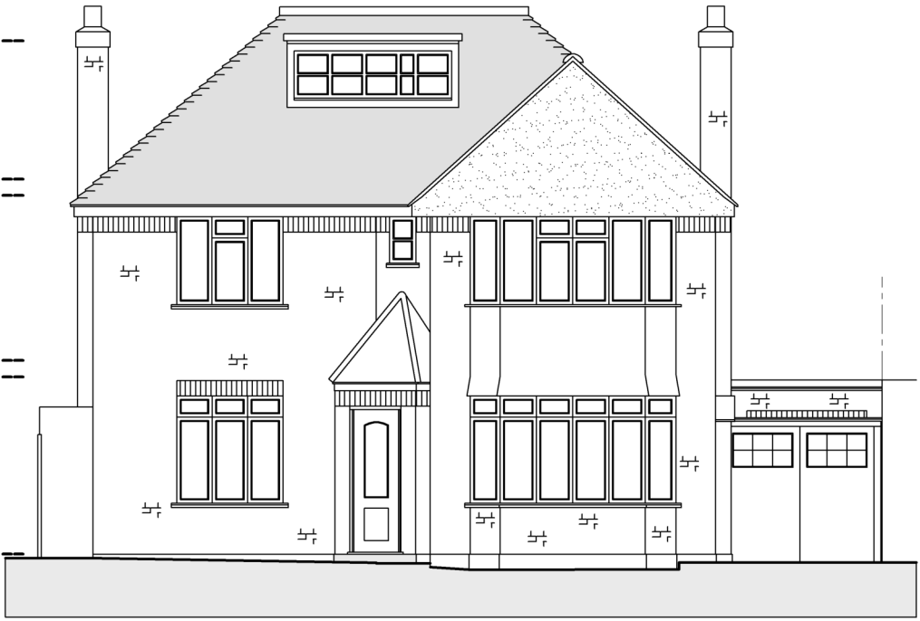
EXISTING DWELLING FRONT ELEVATION