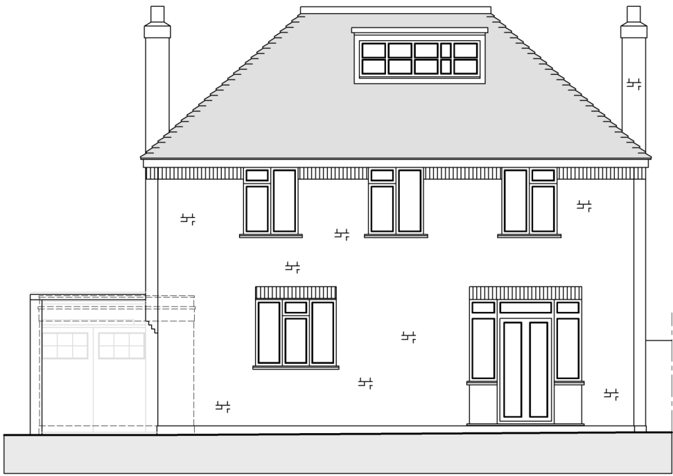
EXISTING DWELLING REAR ELEVATION