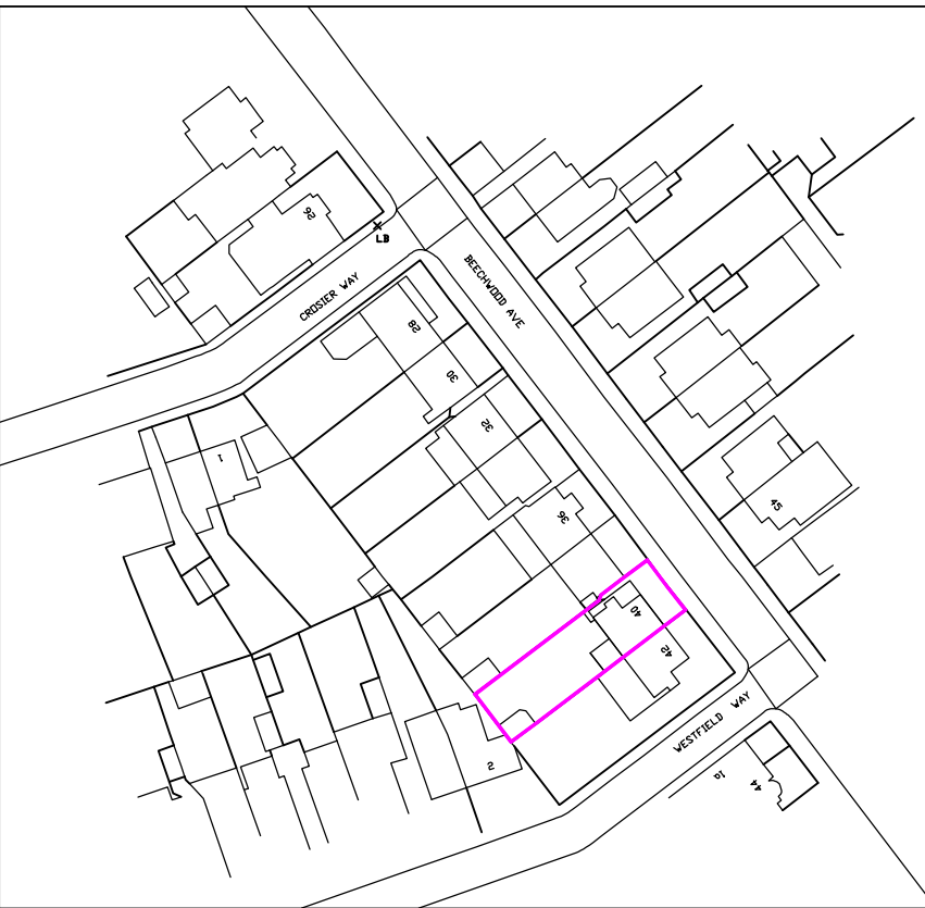
Location Plan 1:1250 @ A1