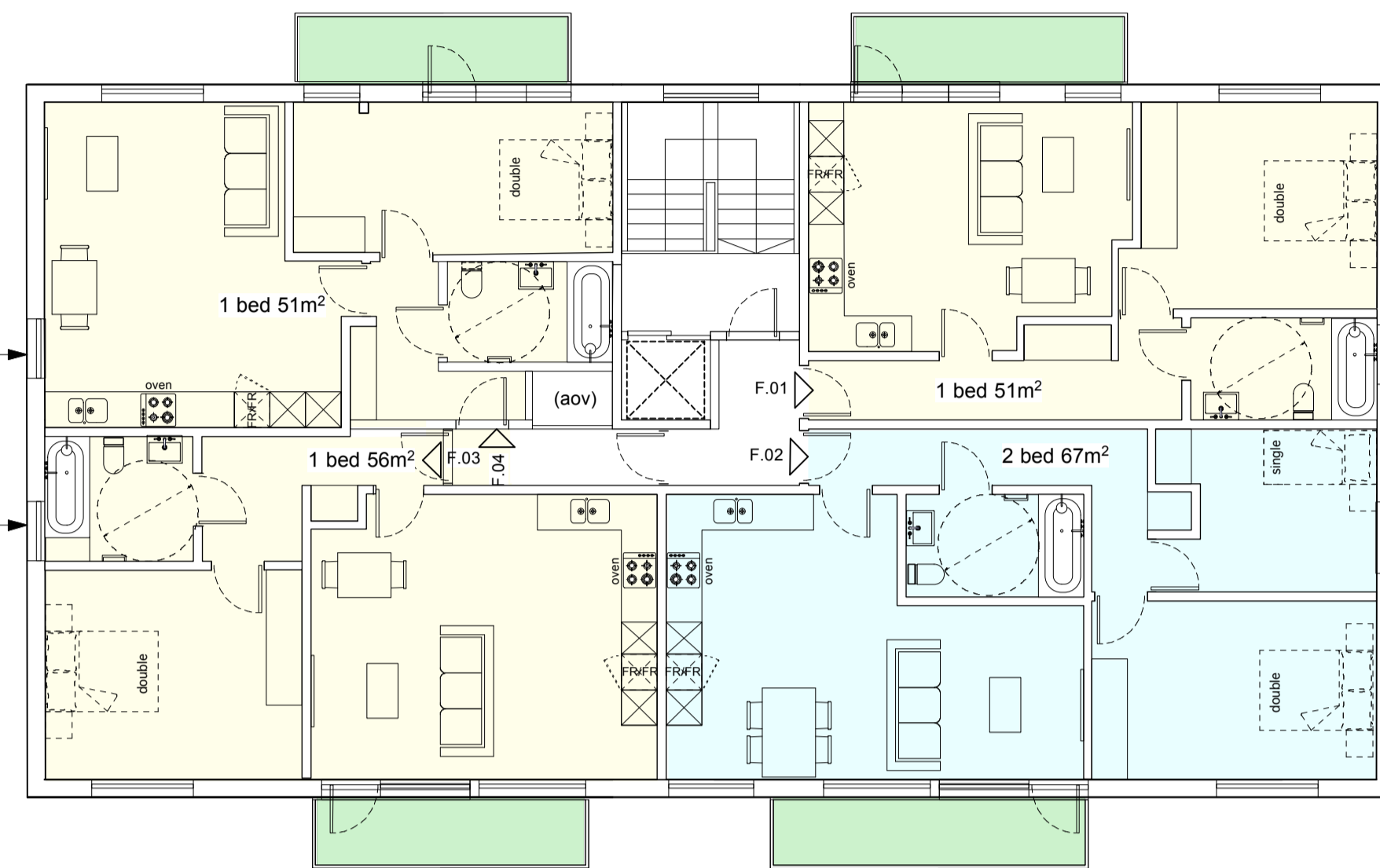
103 PROPOSED FIRST FLOOR PLAN Scale: 1:100