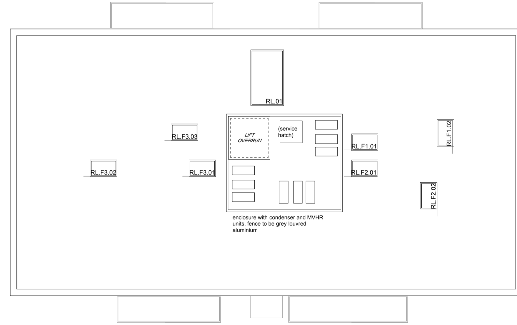
103 PROPOSED ROOF PLAN Scale: 1:100