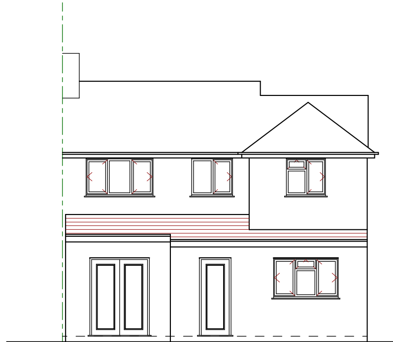
PROPOSED REAR ELEVATION (NO CHANGE TO EXISTING)