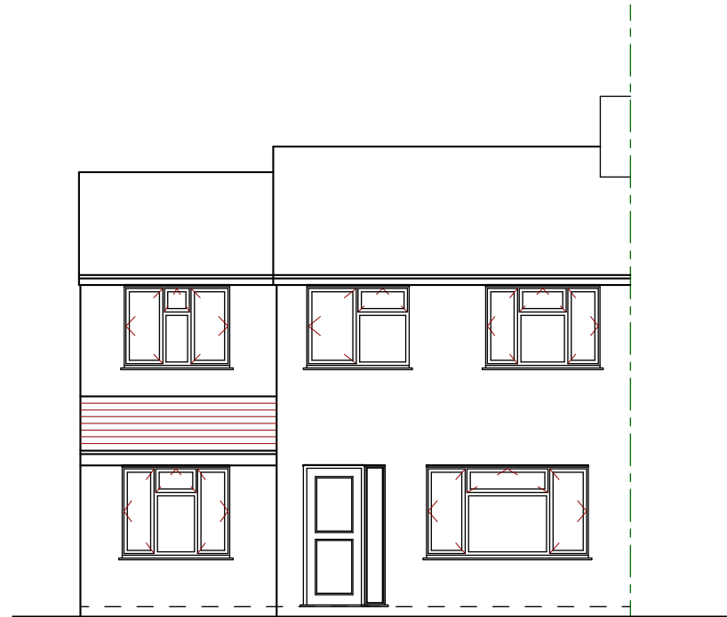
PROPOSED FRONT ELEVATION (NO CHANGE TO EXISTING)