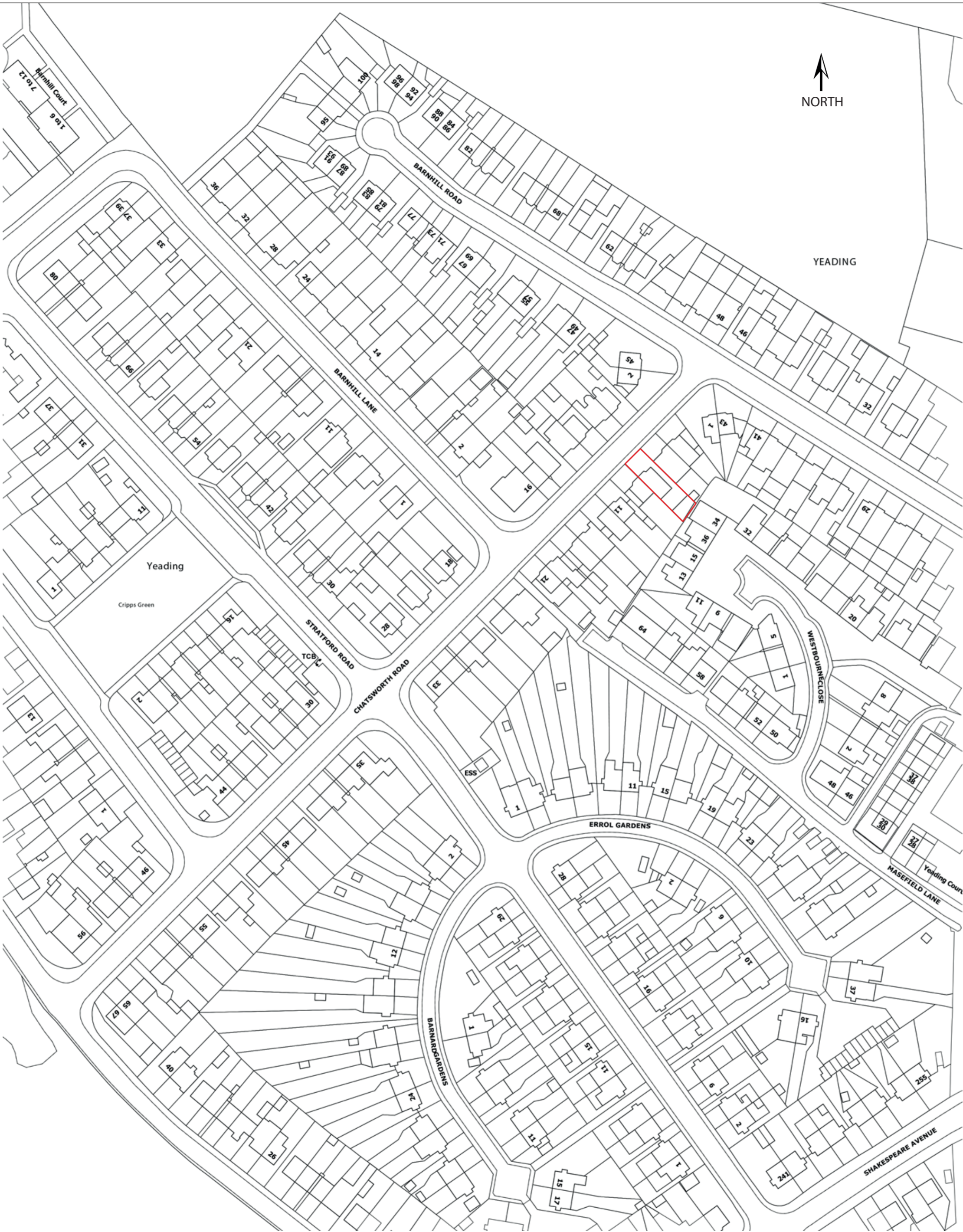
SITE LOCATION PLAN SCALE 1:1250 SITE BOUNDRY :