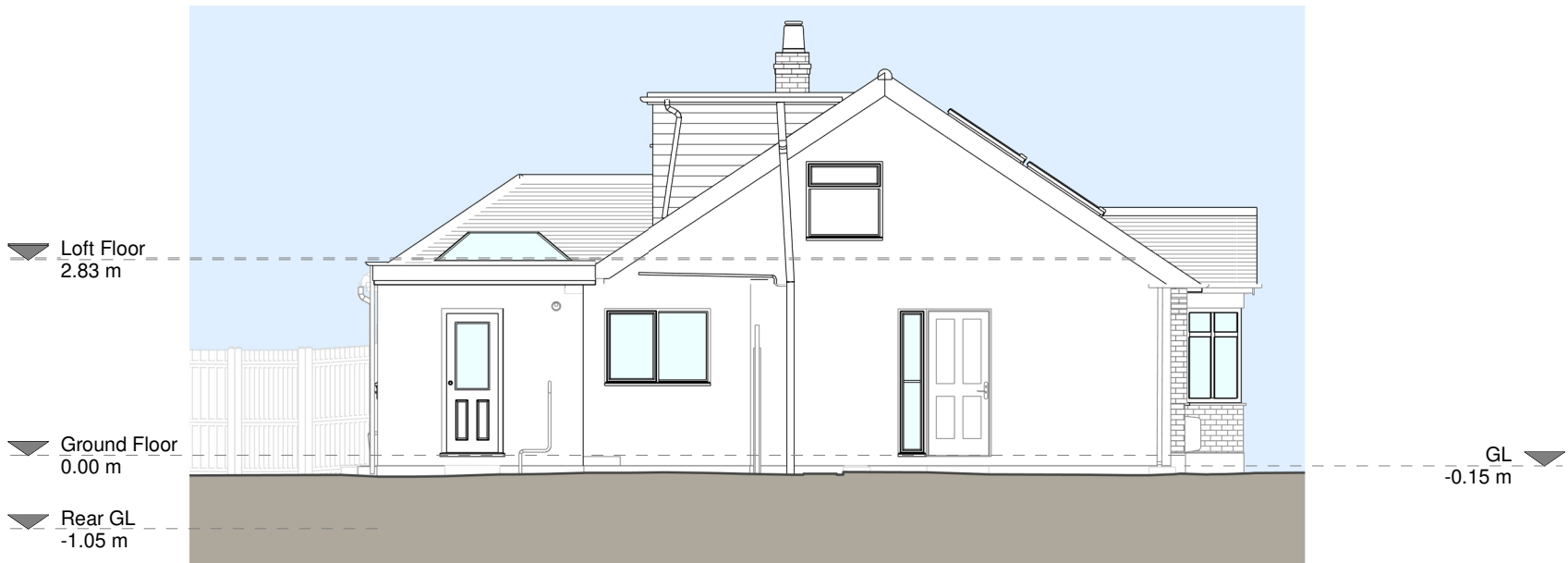
Left Side Elevation